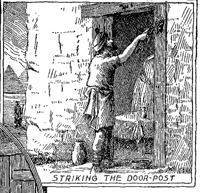
Institution of the Passover as Israel was about to leave Egypt.

So as each family in Israel brought the eldest son to the temple, they were to remember how the children had been saved from the plague, and how all might be saved from sin and eternal death. The child presented at the temple was taken in the arms of the