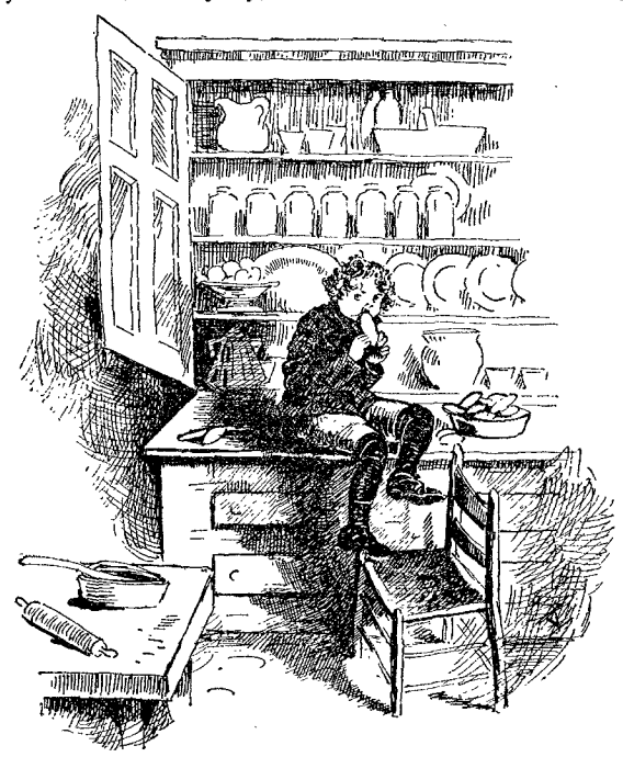
"Helped Himself from the Big Jar."

"What did you do then, grandma?" "I ran home to my mother, my