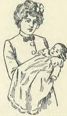
CORRECT METHOD OF HOLDING BABY.

Carrying the Baby. —Those having the care of babies would do well to give attention to the following practical suggestions given in Leonards Illustrated Medical Journal , by whose courtesy we are able also to reproduce the cuts.