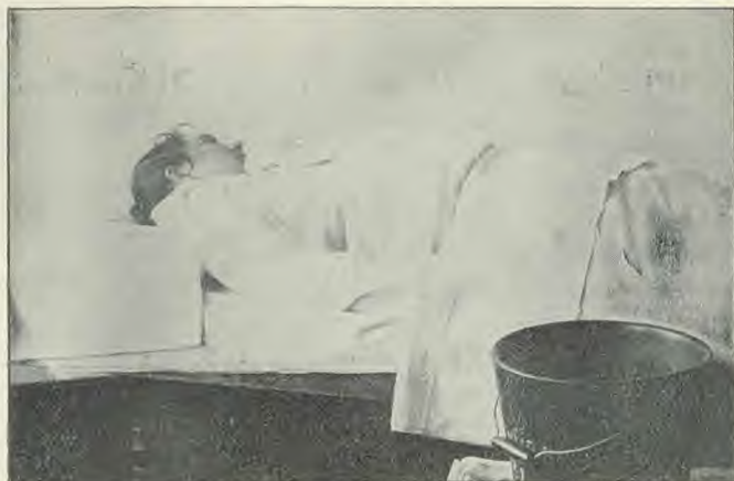
THE FOMENTATION IN PLACE.*

The fomentation is not the only means by which heat may be applied. In some instances it may be difficult to obtain