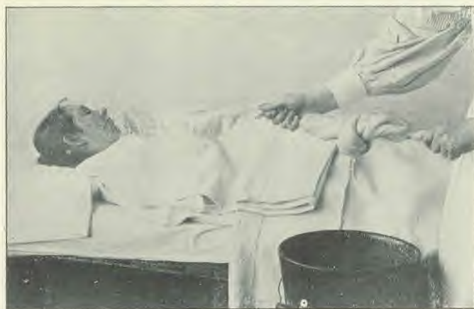
WRINGING THE FOMENTATION.*

cloths of proper size may be made by tearing an old blanket into four equal parts. The hot cloth may be brought into immediate contact with the skin (in which case it is necessary to observe great care not to burn the patient), or a single layer of thin flannel may be laid over the part first, and the fomentation