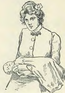
INCORRECT METHOD OF HOLDING BABY.

“The child should always be lifted with both hands, held lightly but firmly, the entire length of the back and the head being carefully supported. One of the