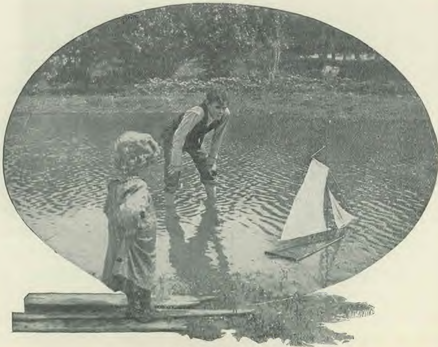
HAVING A GOOD TIME,