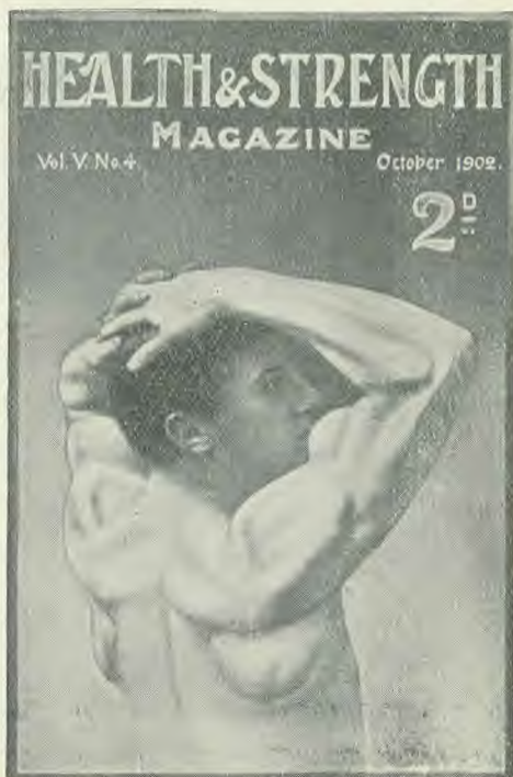
Specimen cover of "Health & Strength."