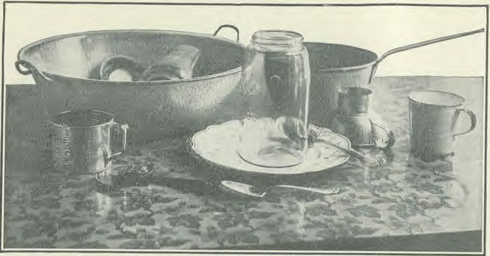
THE NECESSARY UTENSILS.