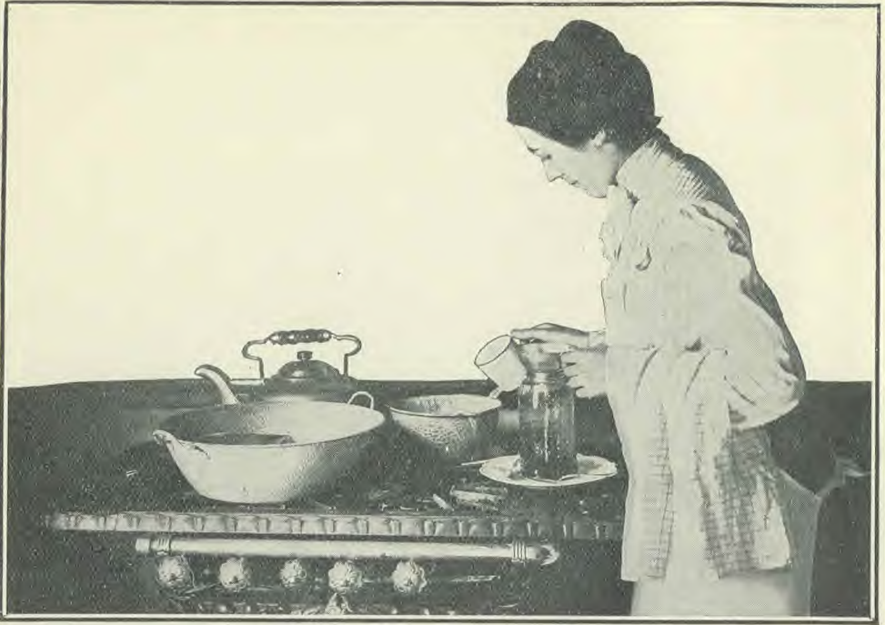
FILLING THE JARS.

The covers should be screwed on tightly, a good fruit-jar wrench being convenient for this purpose.