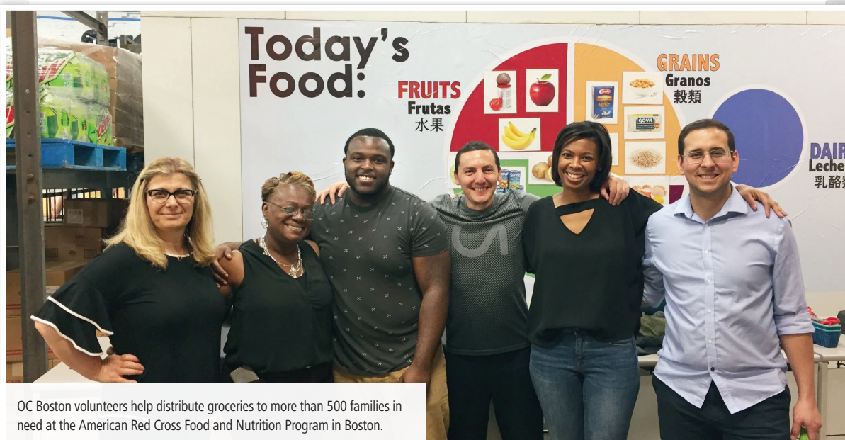
OC Boston volunteers help distribute groceries to more than 500 families in need at the American Red Cross Food and Nutrition Program in Boston.