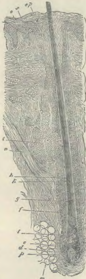
SECTION OF SKIN

The skin is rich in its blood supply and in its glandular systems. It is the chief heat eliminating organ of