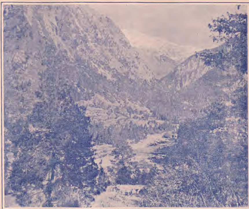
SCENE IN THE KULU VALLEY