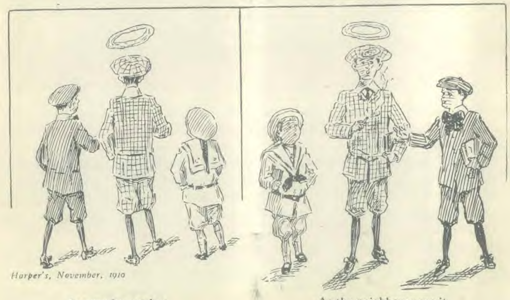
As seen by mother

my predecessor, I noticed that he was continually suppressing the use of the "nail;" and when it came my turn to take charge, I had much of the same difficulty that he had had. Although the sessions were only two hours in length, and the boys could smoke as freely as desired in their cells, it was nearly impossible to keep them from smoking in the schoolroom. When the school was in session, they would light cigarettes and take a puff