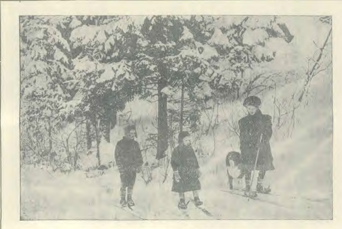
CHILDREN SKIING IN EUROPE