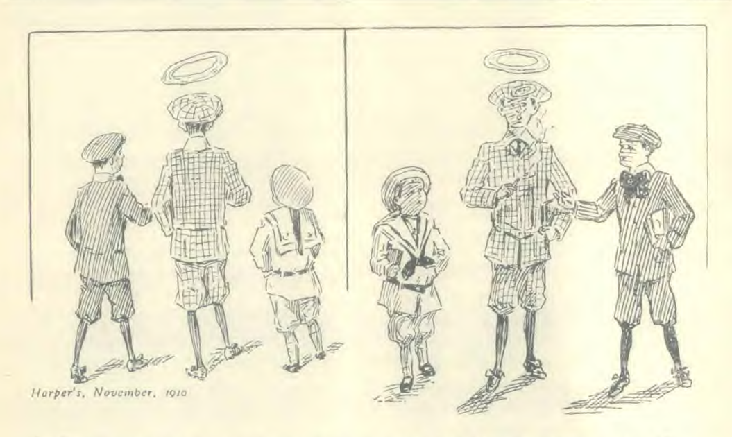
"ONE SIDE OF A TALE LOOKS WELL TILL THE OTHER SIDE IS TOLD."

classes. Unnatural artificial conditions which are rapidly developing among the several communites of the Empire are largely responsible. The educated, as in the west, are the principal sufferers. But it is time that mothers, and fathers too who are ofttimes responsible for the social proclivities of their wives, learned to appreciate the responsibilities of parenthood, to know that the proper care of the infant that they have brought into the world is their first and most important business. No desire for pleasure, the theatre, picture palace, tennis, or tea parties of friends, should be allowed to interfere with the regular, natural dietary of the child. She who neglects this heavengiven task, nay privilege, must soon or late pay the penalty over the weakened physique. the sick bed, or the early grave of her little one. Is the social pleasure worth the W penalty?