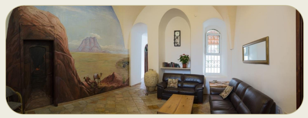
The foyer in the Study Center

The Israel Field will have its own Exhibition Booth during the GC Session with glimpses from the varied activities in Israel, information about our guest-houses, the Hebrew literature ministry and many other things. Please stop by and have a chat, we would love to get acquainted and to catch up with old friends!