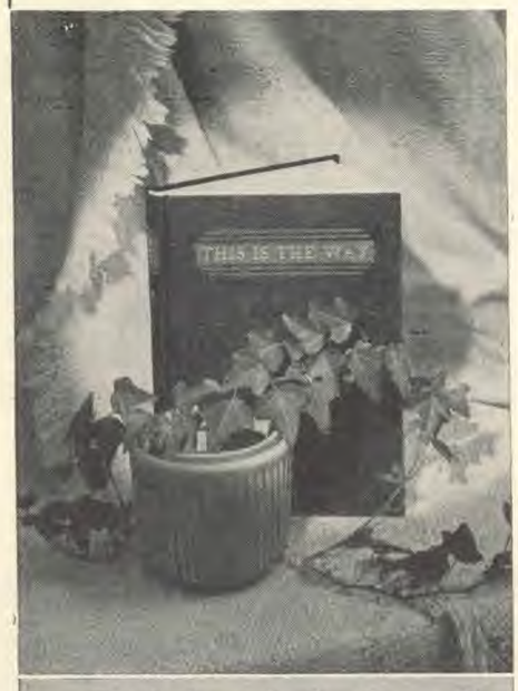
Read these books for soulrefreshment, soul-education, soul-growth and soul-enrichment.