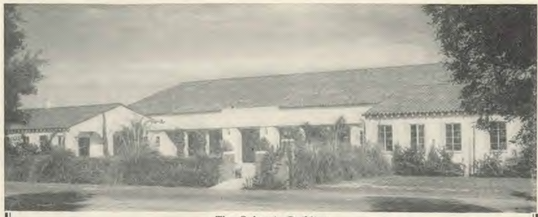
The Cafeteria Building