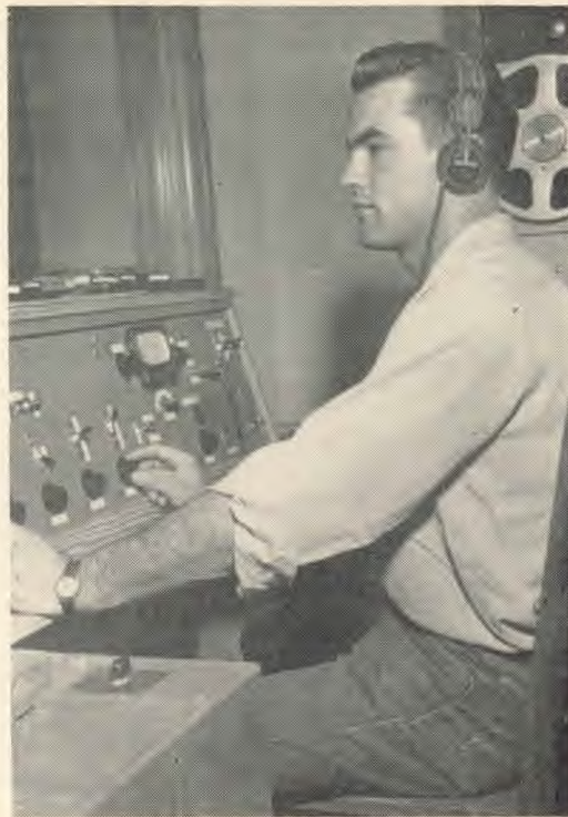
Speech Laboratory, Harold A. Miller Hall

The appreciation of these principles by the educated Christian is, I believe, important in these days. The acceptance of them is even more important. In the fine arts we have the accumu-