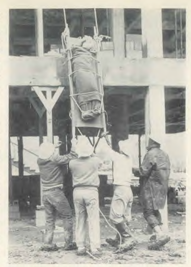
One of Several Methods of Heavy Rescue Used to Remove Injured From a Partially Demolished Building-By Physical Education Men

The Nebraska Civil Defense Agency cooperated handsomely by lending an eleven-tent mobile hos-