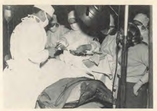
Mobile Field Hospital Operating Room. Men Are Surgeons in Community; Women Are Union College Nursing Majors.