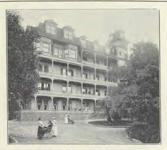
AN IDEAL WINTER RESORT

The largest and best equipped institution west of the Rocky Mountains following the BATTLE CREEK SANITARIUM system and methods of treatment.