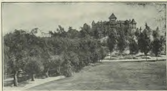
LOMA LINDA SANITARIUM

When you visit the beautiful orange groves of Redlands and Riverside, stop at Loma Linda, or "Hill Beautiful."