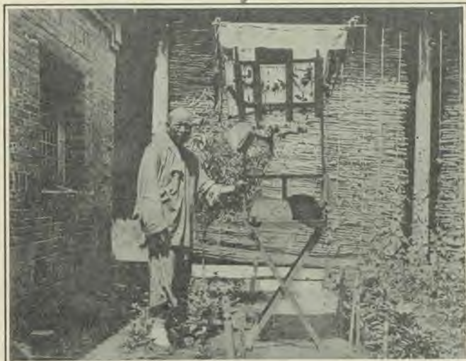
A TRAVELING CHINESE "DOCTOR" AND HIS PORTABLE MEDICINE CHEST

known in his village,—that of the traveling quack, of which the accompanying picture is a good representation. This man has been in this city for several days, and cries at the height of his voice, in a sing-song style, often repeating little strains of poetry, telling the people of the value of the rare remedies he has, and how old some of them are. He usually