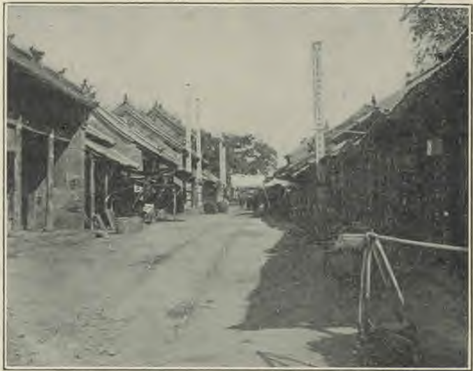
A SHANG-TSI VIEW, MEDICINE SHOP SIGNS

These doctors gather their medicine from every conceivable source, their supply being composed of such things