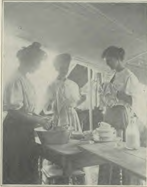
From stereograph, copyright by Underwood and Underwood, New York City

work with some one who is proficient in the art. Do not allow yourselves to grow to womanhood unable to make a creditable buttonhole, darn stockings so they will be comfortable, mend a rent, and do the many other things you will be called upon to do in a family. Remember there is a vast difference between drawing a rent together, and mending it nicely. Sewing-machines are excellent helps, but they will not do everything. Much sewing must be done by hand.