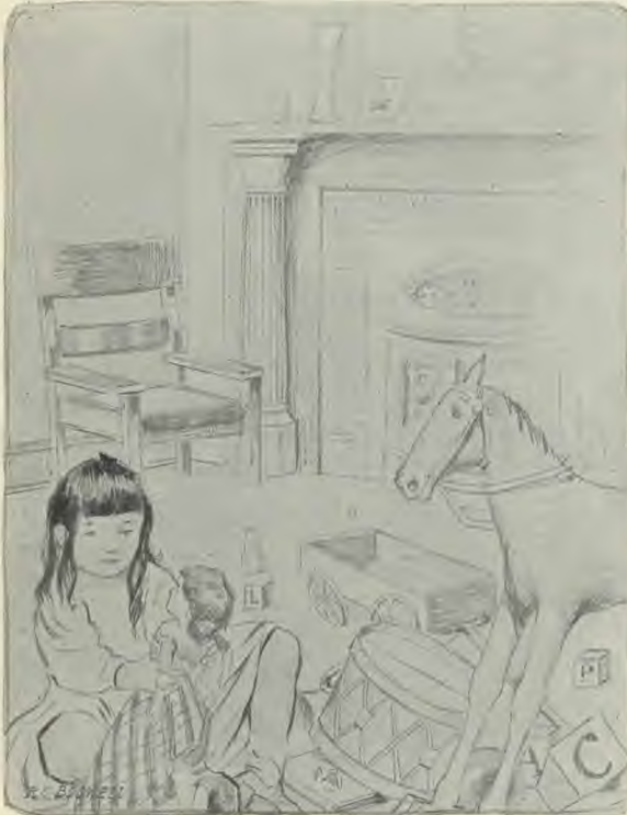
FIRST LESSONS IN DISORDER

Teach tidiness early in life. Let it be-