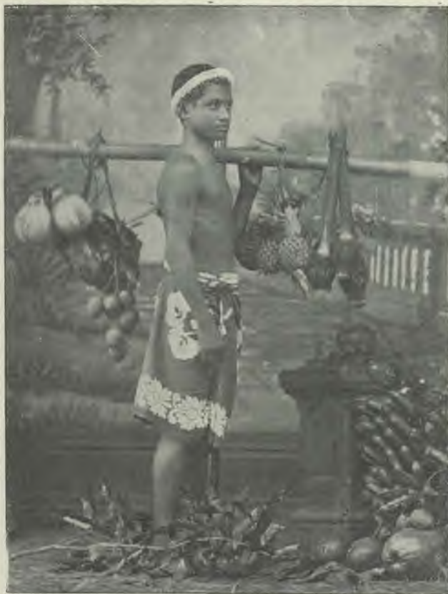
NATIVE FRUIT VENDER

Of course we should not dress the same in a warm climate as in a cold one. Men readily lessen the amount of their clothing; but women sometimes cling to their close-fitting garments, to the detriment of health; and often wear too much clothing, which makes them feel weak and