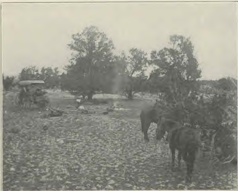
From stereograph, copyright by Underwood and Underwood, New York City

Malaria, which is now becoming known by the more appropriate name "mosquito fever," is another possibility to be thought of in some sections. In looking over advertisements of "cheap summer boarding places," do not fail to read between the lines, remembering that advertising is the fine art of lying for profit, and that the average summer-boarder advertiser is an adept in this line.