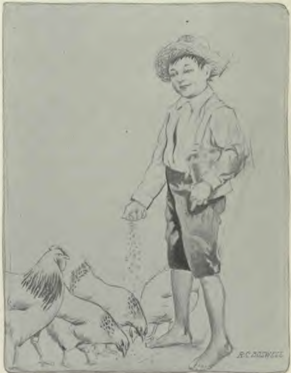
HE SOMETIMES FORGOT

Promptness is a good antidote for forgetfulness. It is the work that we loiter about doing that is neglected or done carelessly. Promptness should not be misconstrued to mean ruthless haste. Inculcate the motto, "Whatever is worth