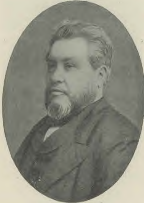
C. H. SPURGEON

which the question may be viewed, Sunday legislation is wrong.