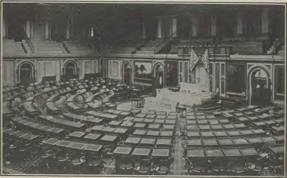
HOUSE OF REPRESENTATIVES

Upon its own showing, the bill is designed