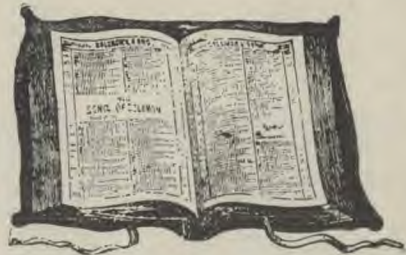
"PREACH THE WORD"

"The Baptist doctrine that a man could be made a Christian only by the free action of his own spiritual nature left the civil magistrate nothing to do [with religious observances]. . . . They saw that while a man might by force be brought to baptism or the Lord's Supper, he could not by force be brought to believe. Others might abstain from persecution because their pity was