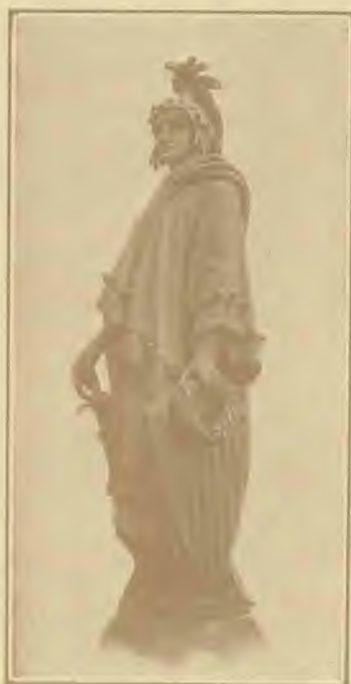
GODDESS OF LIBERTY SURMOUNT ING CAPITOL DOME