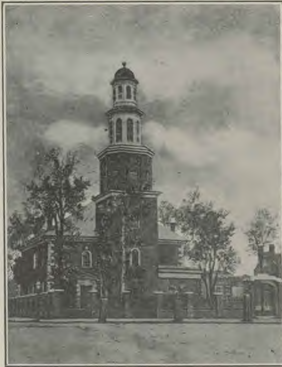
CHURCH AT ALEXANDRIA, VA., WHERE WASHINGTON ATTENDED

But a mighty power was seen. Superstitions and traditions of men were swept away. Priests and rulers were powerless to stay the onward march of the gospel. A very brief pe-