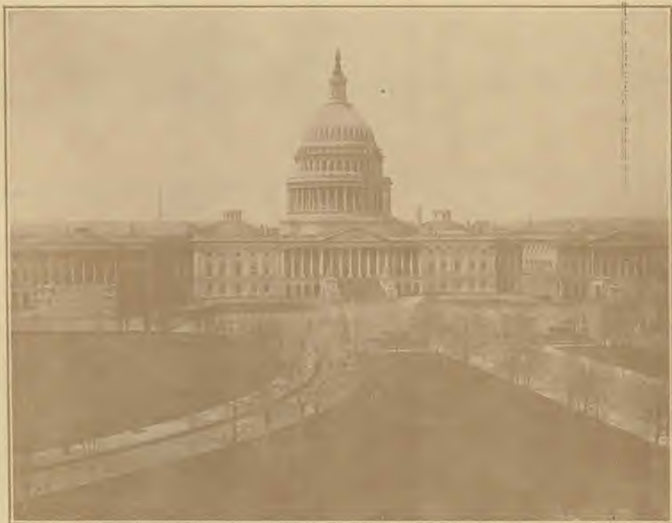
UNITED STATES CAPITOL, FRONT VIEW

Devoted to the American Idea of Religious Liberty Exemplified in the Complete Separation of Church and State