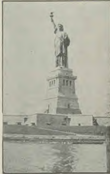
LIBERTY ENLIGHTENING THE WORLD

The spirit of freedom spread. The influence of the example set by the new nation extended far and wide. In every nation men began to call for liberty and to demand their rights,—freedom to hold and express their opinions without fear of molestation, and to worship God according to the dictates of their own conscience. Old laws restricting the liberties of the people were repealed, or allowed to fall into disuse and become a dead-letter. Persecution died out. Freedom asserted herself, and the rights of man, for once in the world, sat on the throne.