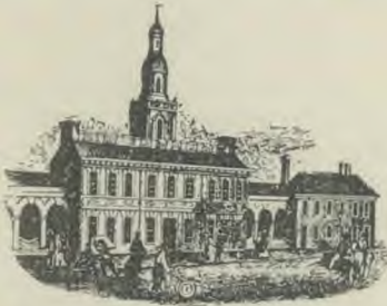
INDEPENDENCE HALL, PHILADELPHIA, PA.

The question, What is the law? is therefore not the question lying at the foundation of one's duty in any religious or spiritual matter which is brought before him. There is another question lying deeper than this, and that is the question,