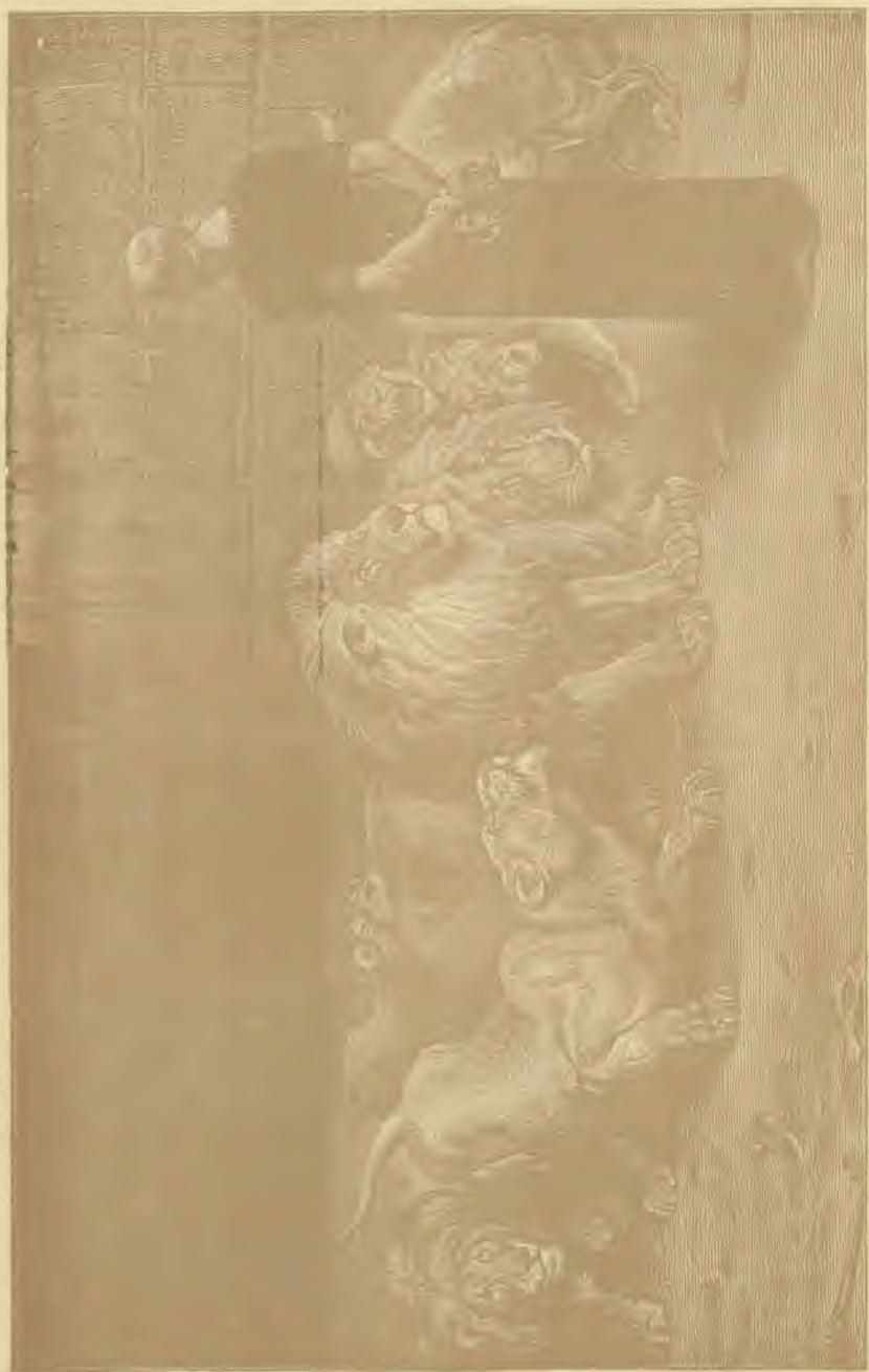
GASPER IN THE LION'S DEN.