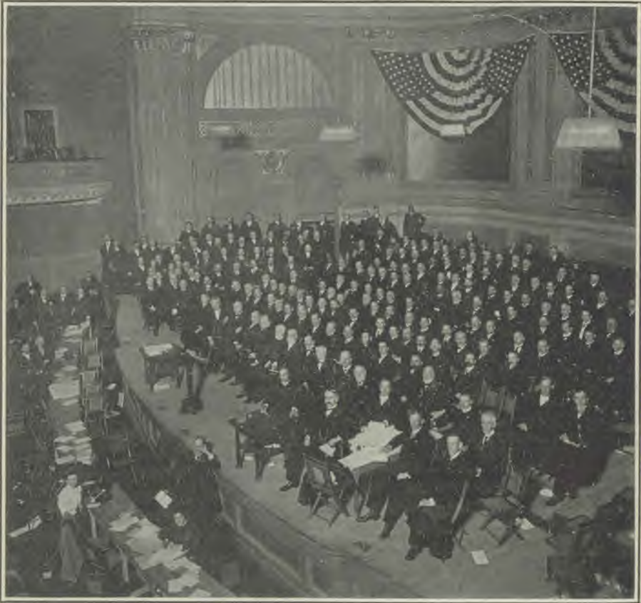
INTER-CHURCH FEDERATION CONFERENCE, NEW YORK, NOV. 15-21, 1905

The influence of the leading religious bodies of the country, the leading institutions of learning, the leading religious journals, and many of the leaders in politics, is back of this movement. It repre-