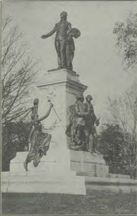
LAFAYETTE MONUMENT, WASHINGTON, D. C.

One man may conclude on a hot Sunday that it is a "necessity" for him to have some "refreshments." But there are thousands who live year after year without any refreshing drink, except water. It may