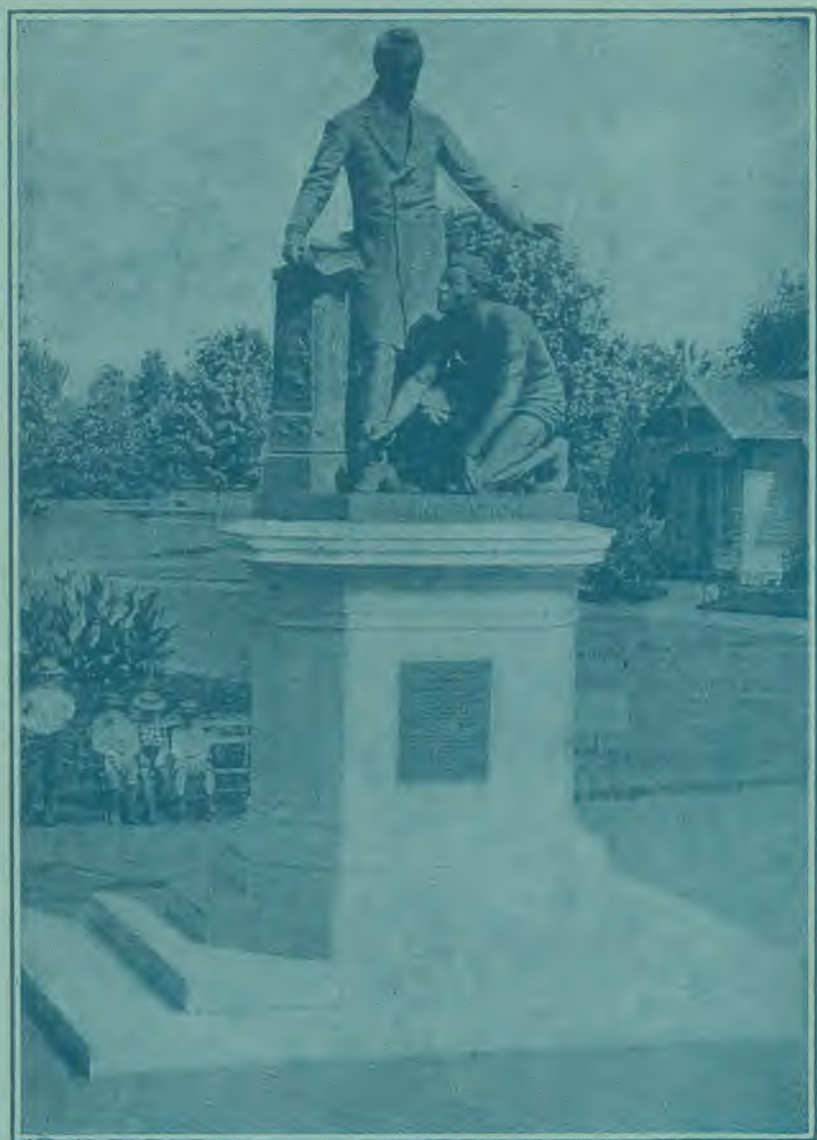
Lincoln Monument, Washington, D. C.