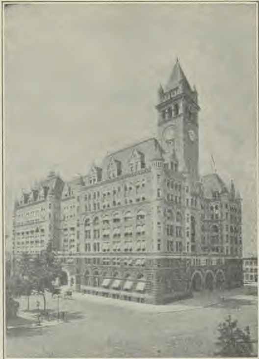
POST-OFFICE, WASHINGTON, D. C.

This bill, which seems the least objectionable, has bound up in it the same dangerous principles contained in the other two, in that the national government is to make a distinction between Sunday and other days. There came before the Congress of