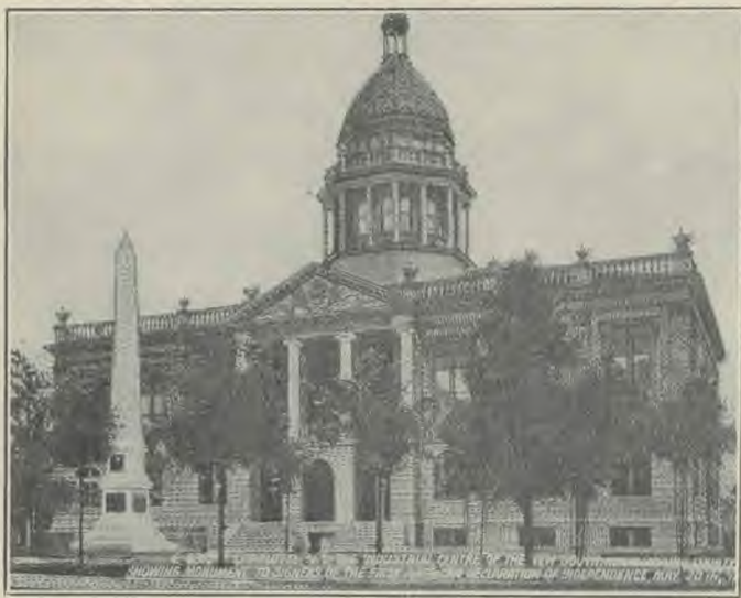
MECKLENBURG (N. C.) COURT-HOUSE; SHOWING MONUMENT TO SIGNERS OF THE FIRST AMERICAN DECLARATION OF INDEPENDENCE

All this, so far as civil government is concerned, is pretty generally, in theory at least, admitted. That it is as generally, however, admitted in practise, could not with equal truth be asserted. The distinction in civil right, which even now exists in most countries in Europe between those who worship God in one way and those who worship him in another, shows that the truth on this subject has not yet wholly eradicated the persecuting usages of a darker age. Nor is our own country yet entirely free from the reproach of interference in matters of this kind, although the evil shows itself in a modified and disguised form, and