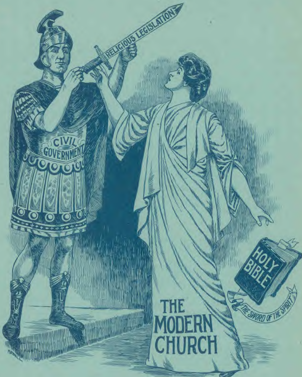
TURNING TO CAESAR