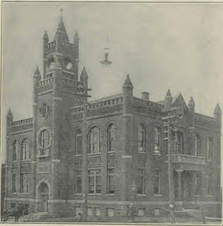
CITY HALL AT GUTHRIE, OKLAHOMA, WHERE THE CONSTITUTIONAL CONVENTION WAS HELD

The distinctions between toleration and liberty were clearly pointed out in the early history of this country. When Virginia, one of the first States of the Union to