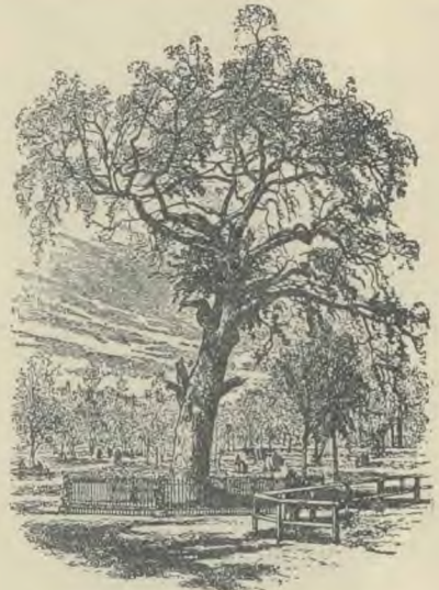
LIBERTY TREE, BOSTON COMMON

— Because the true principle of Christian liberty had not been grasped, and is to this day apprehended by only a few. The right of any body of men to differ in opinion from others has always been claimed by them; there is no novelty in that. From the beginning, every Christian sect that has arisen has vehemently contended for its right to differ from others. But in few cases has any sect conceded the right of others to differ from it, or forbore to persecute when it had the power. And in