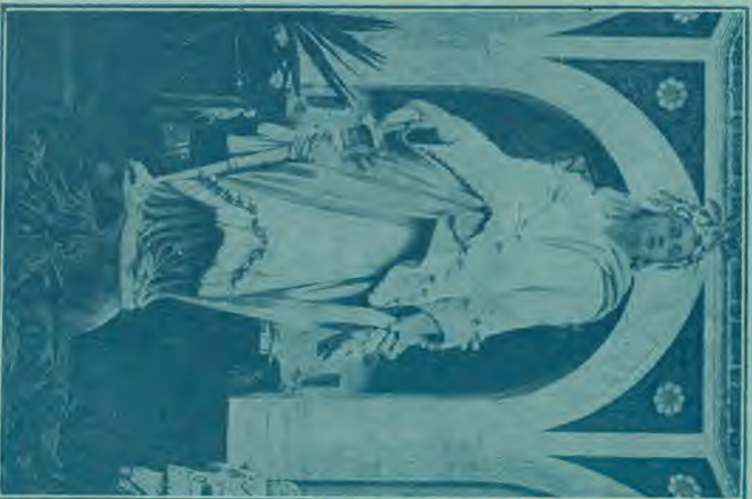
LIBERTY STATUE, CAPITOL BUILDING, WASHINGTON, D. C.

IDEA OF RELIGIOUS LIBERTY COMPLETE SEPARATION AND STATE