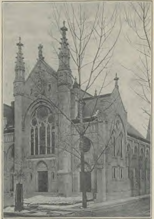
THE CHURCH IN WASHINGTON WHERE PRESIDENT ROOSEVELT ATTENDS

the coinage. But as I did not approve of it, I did not direct that it should again be put on. Of course the matter of the