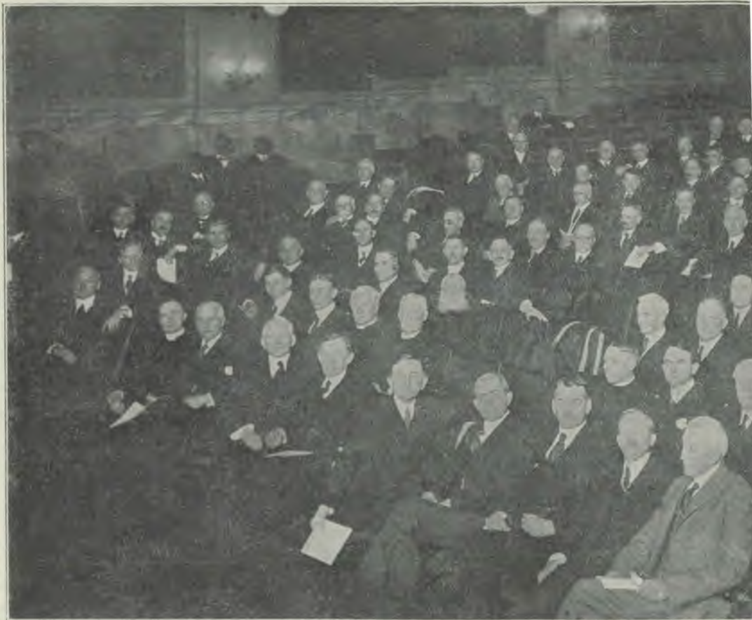
ONE OF THE CONFERENCES OF THE INTER

arguments were presented for church unity then as are presented now. The great church leaders met in holy conclave, and finally during the fourth century perfected a complete organic union of all the local congregations. This union was the mightiest church force that was ever organized. It swept