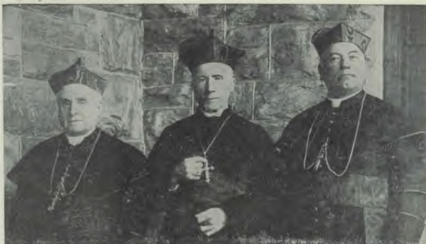
CARDINALS FARLEY, GIBBONS, AND O'CONNELL