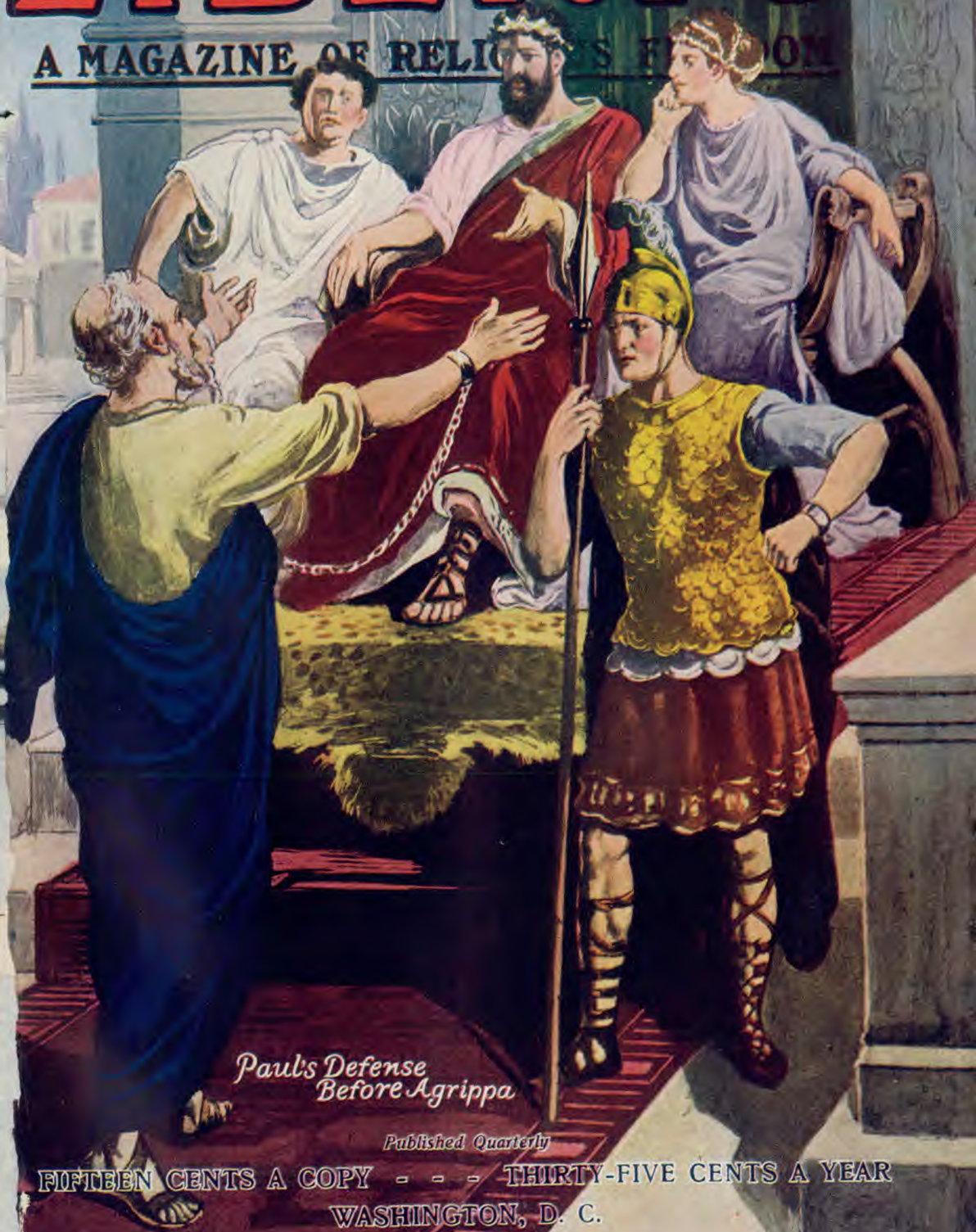
Paul's Defense Before Agrippa