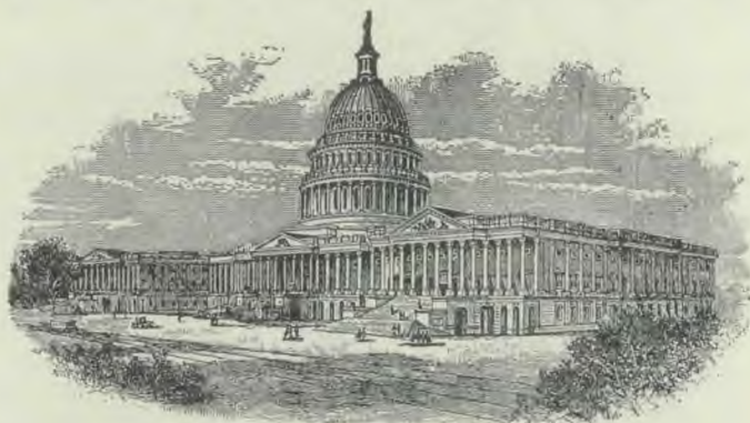
The Capitol at Washington

When we realize that the Pastors' Federation and the Lord's Day Alliance, according to their own statement, intend this ecclesiastical measure to become "a model Sunday law," not only for the people of the District of Columbia, but for the whole nation, it is at once a subject of vital national interest. If these ministers of the gospel are to prescribe our religion for us and compel us to conform to their notions under duress of civil law, it is high time that every American citizen raised his voice and pen in protest against these encroachments upon our inalienable rights of re-