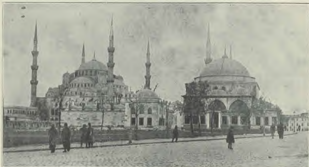
MOSQUE OF AHMED I, CONSTANTINOPLE