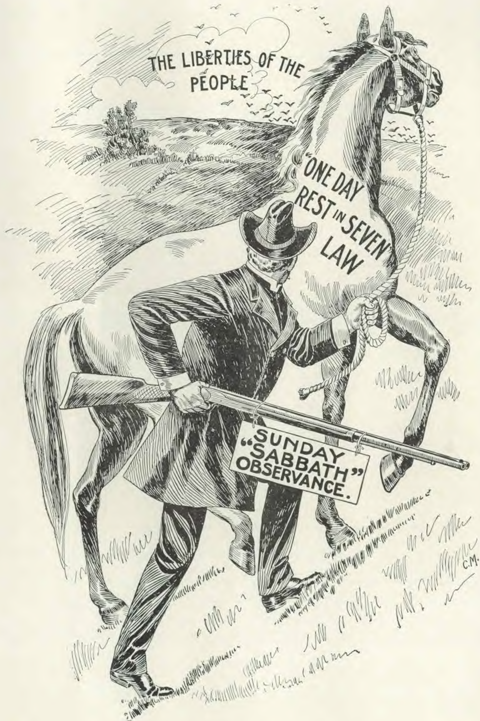
THE STALKING HORSE (See page 64)