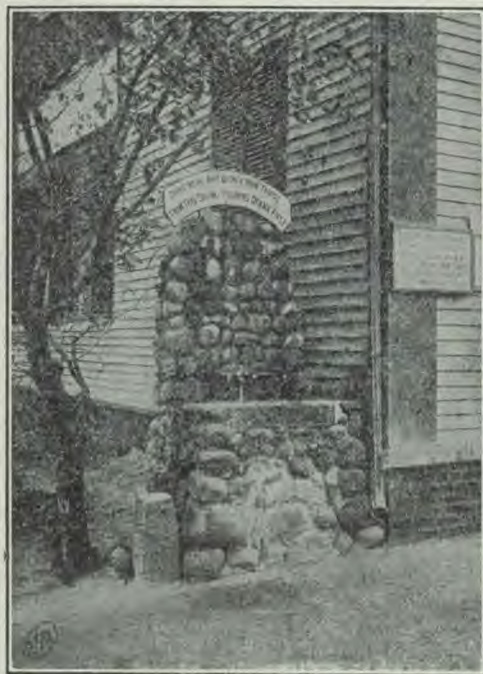
Spring at Plymouth, Mass., from which Pilgrim Fathers drank

The ministers claim they are advocating Sunday laws in behalf of the poor workingman. But what has the prohibition of all pleasure and recreation on Sunday to do with the workingman's welfare. The workingman who is a non-churchgoer wants to spend the day at pleasure resorts to revive his spirit and energies, but this privilege the ministers