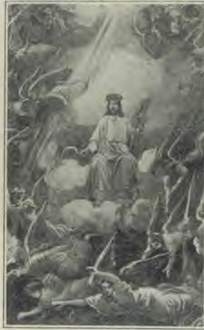
The second coming of Jesus Christ is the only remedy for all our ills.

lowers. The Lord of heaven will be compelled to smite the nations with the rod of iron, and break them in pieces. The kingdoms of this world will be overturned and destroyed. After this sudden and forcible overthrow of earthly carnal kingdoms, the God of heaven is to set up His own kingdom, which shall never be destroyed; and this kingdom of righteousness shall be given to the saints of the Most High, who shall possess it forever and ever, according to the prophecies of the books of Daniel and the Revelation.