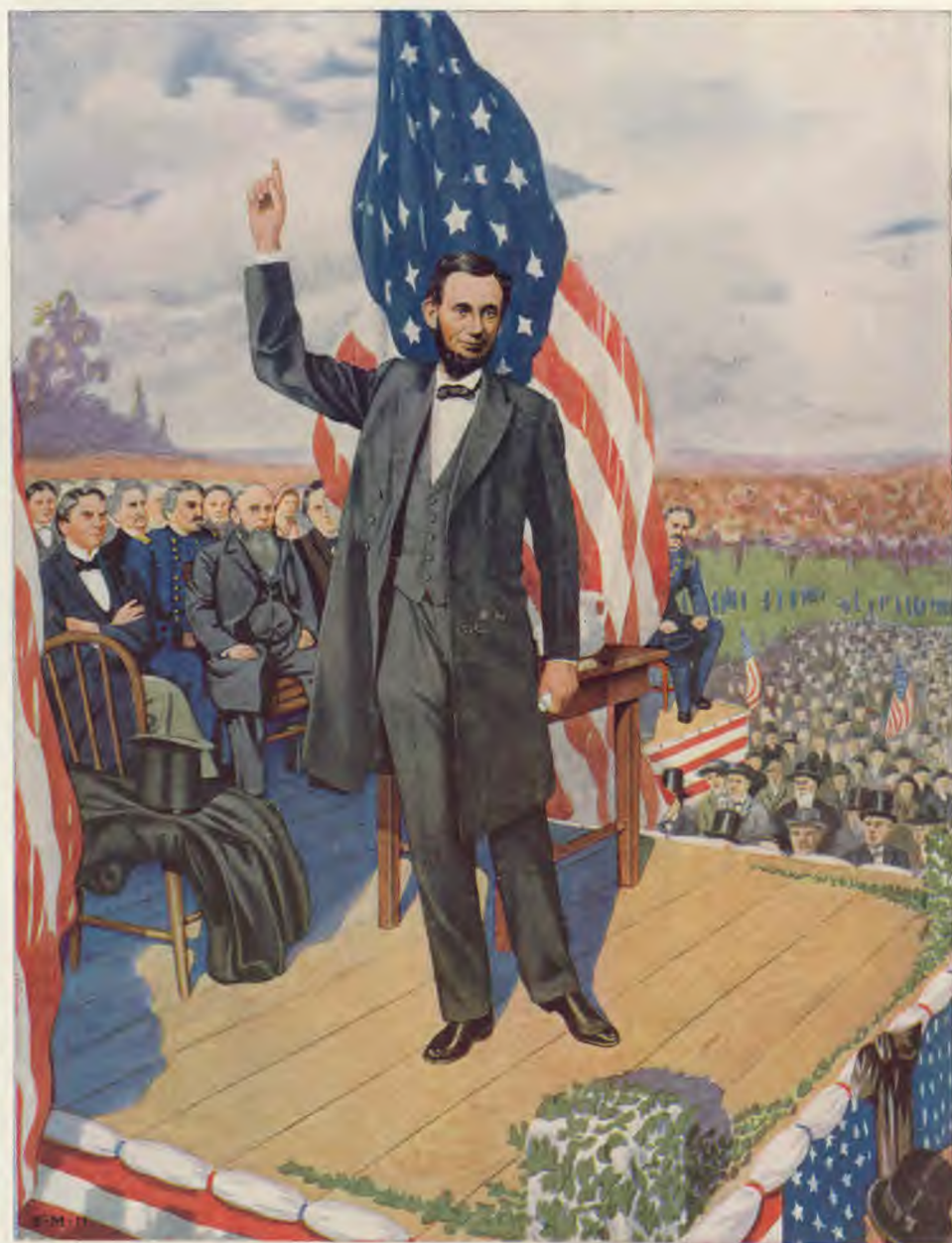
LINCOLN AT GETTYSBURG

WHAT IS THE MATTER WITH THE WORLD TODAY? Page 3