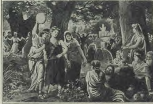
Instead of the world's growing better, as many imagine, Christ said it was to become worse and worse, until just before its destruction it would be as bad as it was in the days of Noah and Lot.

any practical system of social and civil ethics must recognize this constitutional defect in fallen human nature. With man in his sinful state it is simply impossible to establish a permanent reign of peace and good will among nations, with their conflicting interests and selfish ambitions.