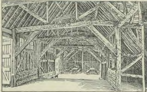
This barn, containing timbers of the "Mayflower," was used by the Friends of Buckinghamshire, England, for a place of worship.

estant minorities whose rights are protected under the constitutions of these countries, by declaring the old laws unconstitutional. But not infrequently the local authorities, inspired by the priests, take the law into their own hands and enforce their local unconstitutional statutes with the utmost possible severity.