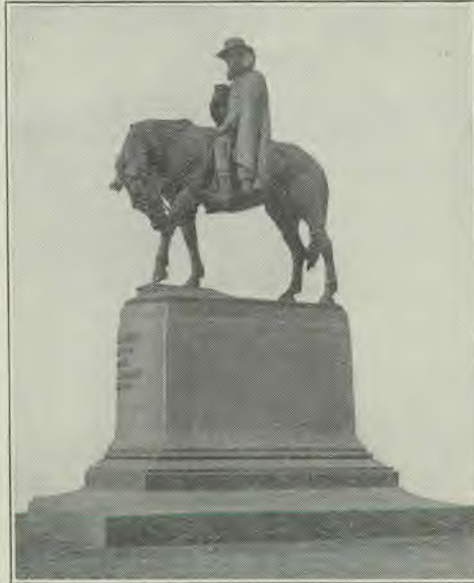
National, D. C. Statue of Francis Asbury, Pioneer Bishop of the Methodist Episcopal Church in America

"Curiously enough, the denominational leaders before whom President Coolidge eulogized this bishop, who did so much to establish Methodism in this country, are spending much of their energy in the anterooms of Cæsar, though in this respect they are perhaps not more conspicuous than those of other denominations. Did they but know it, they are weakening the very sources from which the churches must draw their strength for religious service in behalf of society and of the nation, and at the same time by the misuse of good intentions are developing