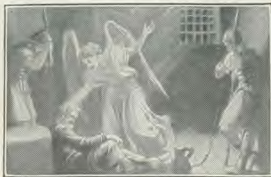
PETER DELIVERED BY AN ANGEL

REVIEW AND HERALD PUB. ASSN. Takoma Park - Washington, D. C.