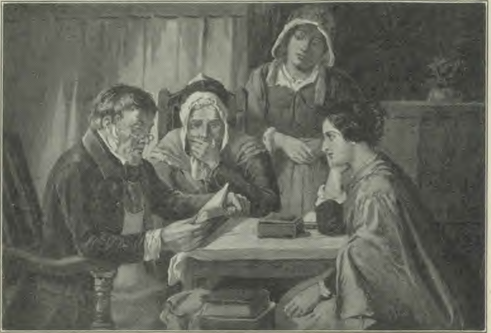
"Parents generally in the evening either held family prayers, or at least read the Scriptures."