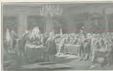
SIGNING THE DECLARATION

REVIEW AND HERALD PUB. ASSN. Takoma Park - Washington, D. C.