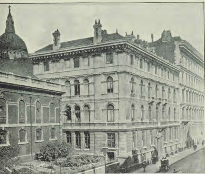
is now occupied by the headquarters building of the British and Foreign Bible Society, which has issued 310,729,340 copies or portions of the Holy Scriptures. The American Bible Society, had printed and circulated, up to 1870, 1,000,000 copies or portions thereof, in 733 languages.