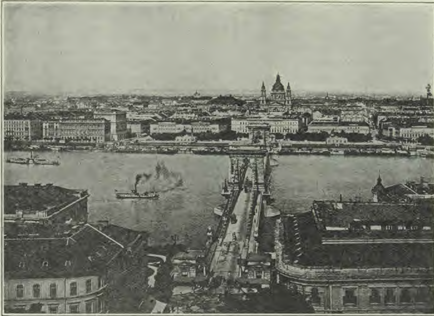
Chain Bridge Across the Danube at Budapest, Hungary