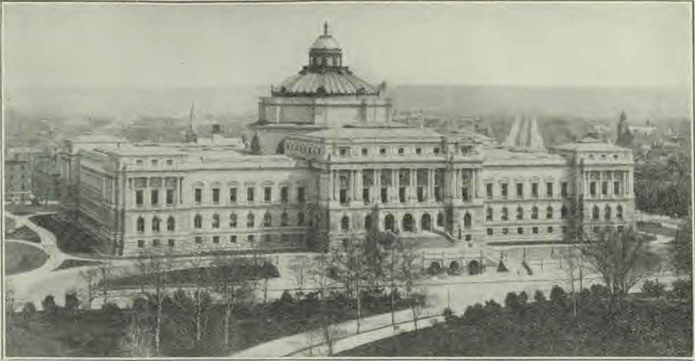
The Library of Congress, Washington, D. C., in which are enshrined the originals of those two great American Documents,—the Declaration of Independence and the Constitution of the United States