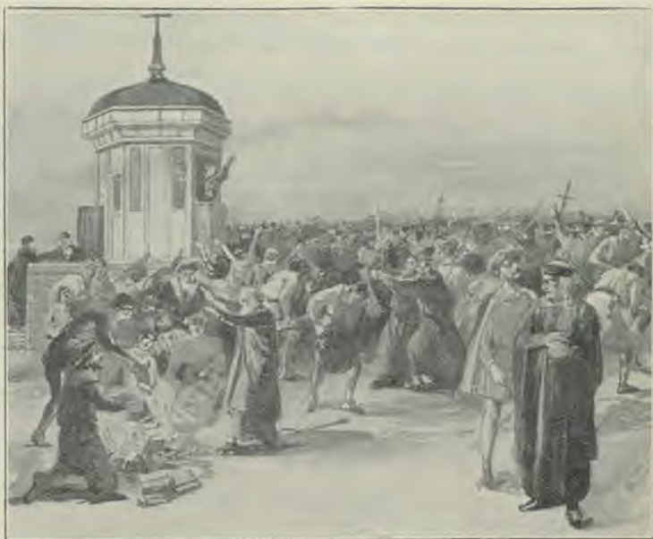
Burning Bibles at St. Paul's Cross, London, 1527. This scene was depicted by the British and Foreign Bible Society, shown on the right, which, up to 1922, had burned 518,467 Bibles. The three societies, the British and Foreign, the Oxford Protestant, and the Bible Society, had burned to the close of 1922, a total of 518,467.

On one Sunday, two hundred thirty-two Friends were taken from London meetings and sent to Newgate prison. In March, 1665, there were more than three hundred fifty Friends imprisoned in London alone, mostly in Newgate