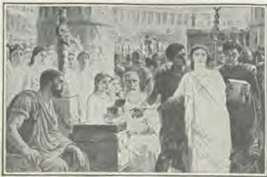
CHRIST OR DIANA?