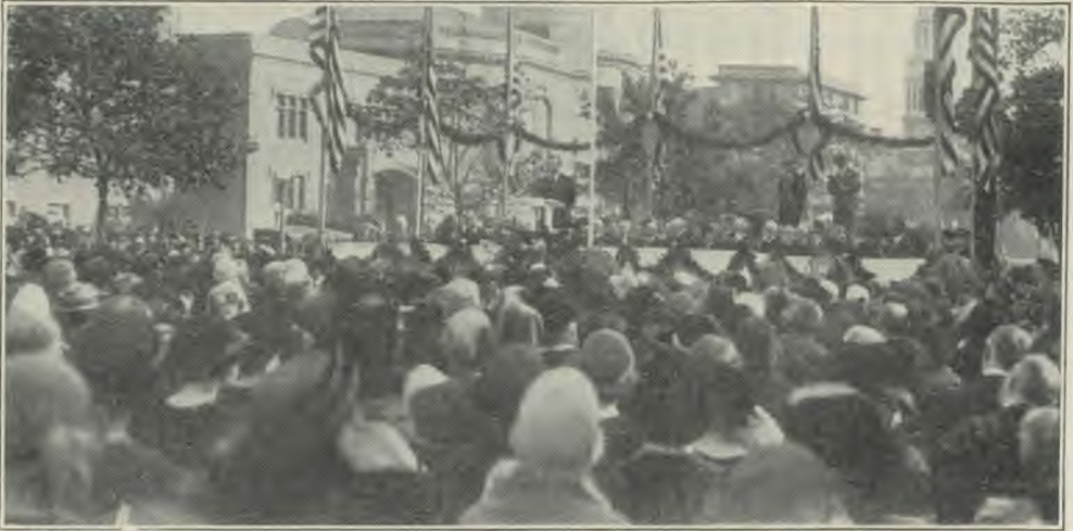
National, D. C.

President Coolidge Speaking at the Unveiling, in Washington, D. C., of a Statue of Francis Asbury