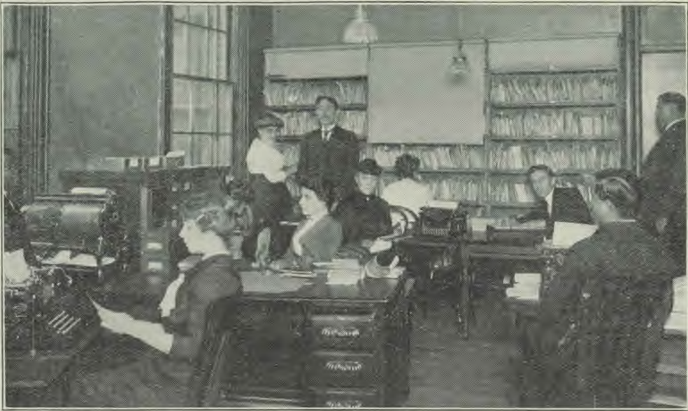
National, D. C.

Office of the International Reform Bureau, headquarters of one of the religious lobbies operating in Washington, in the interest of Sunday laws.