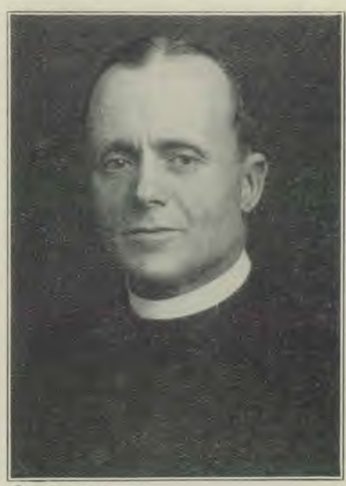
O u. a u., N. Y.

"There is no more ethical, moral, or spiritual harm in a poor man engaging in athletic sports