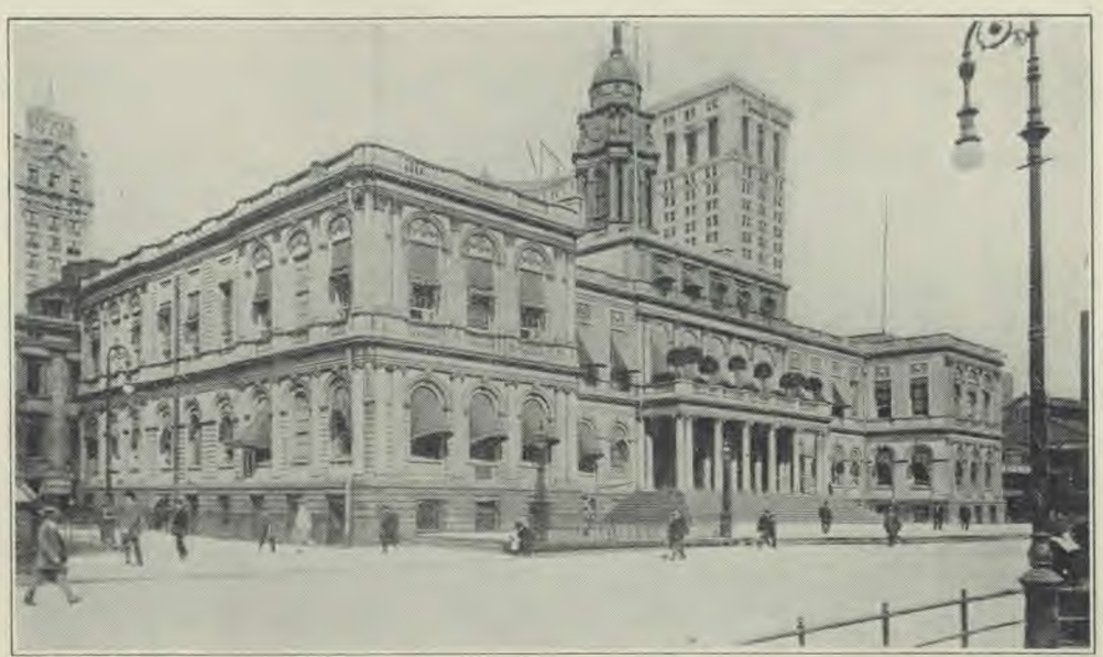
U. & U., N. Y.