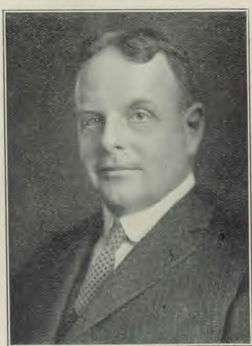
HARRIS & EWING

"The greatest problem, however, is not to popularize good sports, but to popularize essen-