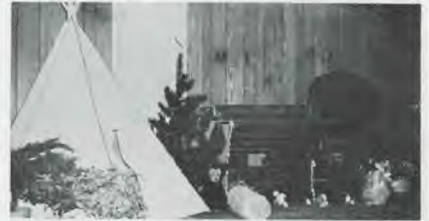
An Indian teepee and log house were used as a background for the Pilgrim's story.

A reporter from the local newspaper was invited to view the program and was truly amazed at the morning's presentation for 0-3 year old children. In her life-long attendance and teaching of Sunday Schools she had never seen anything to compare with it.