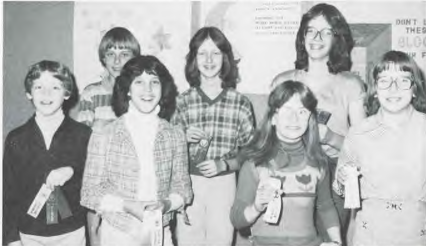
Elementary Church School students from Enterprise participated in Health Month with posters, cartoons, jingles, and short stories.