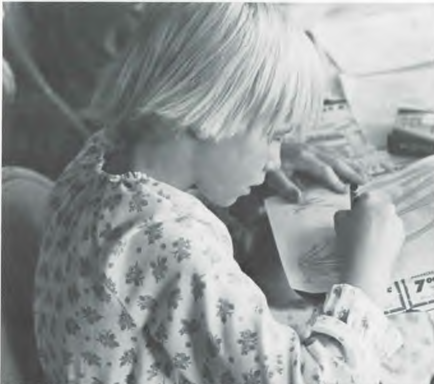
Crafts and other art work keeps kindergarten children busy during a Vacation Bible School session. Is your church planning a Vacational Bible School this year?