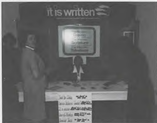
IT IS WRITTEN display.