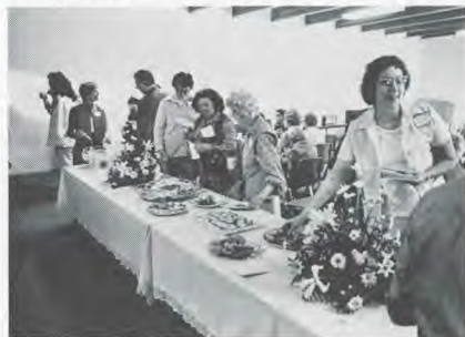
Beautiful tables laden with homemade cookies and punch were enjoyed by the 200 guests at the dedication celebration of the new community service center.