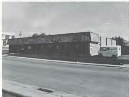
The new Denver, Colorado Community Service Center.

On May 5, State and City officials and Seventh-day Adventist members gathered at the new Denver Seventh-day Adventist Community Service Center for a dedication celebration. For 30 years the members of the churches in Denver have looked forward to the time when they could own a building specifically designed for community services. That dream has finally become a reality.