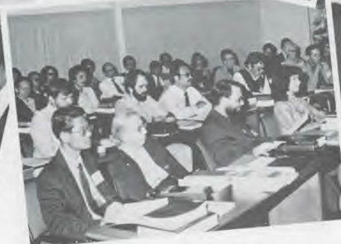
Those in attendance listened attentively.