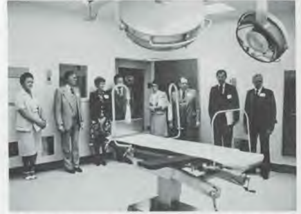
The modern operating room in the new facility.

The medical center opening marked the completion of a 29-month building program and years of planning by Moberly area residents for a new hospital to replace the two existing hospitals, both of which were built in the early years of this century and no longer met present healthcare standards and licensing requirements.