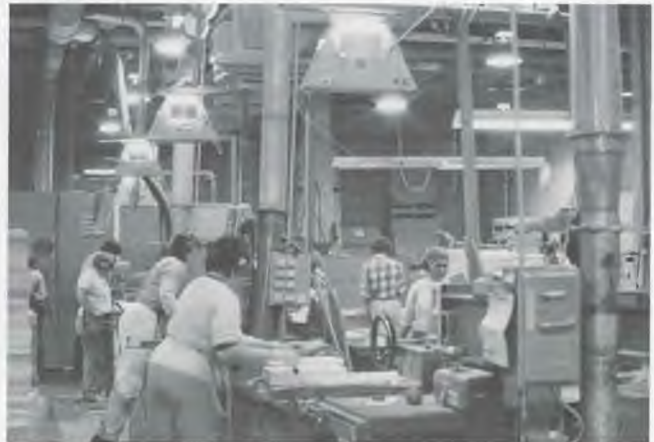
Machine operators in the Mill Room.