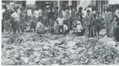
Piles of rubbish in the streets in Phnom Penh.

piled everywhere. The Khmer government has also accepted a proposal for SAWS to bring in 125 tons of clothing during the next 12 months.