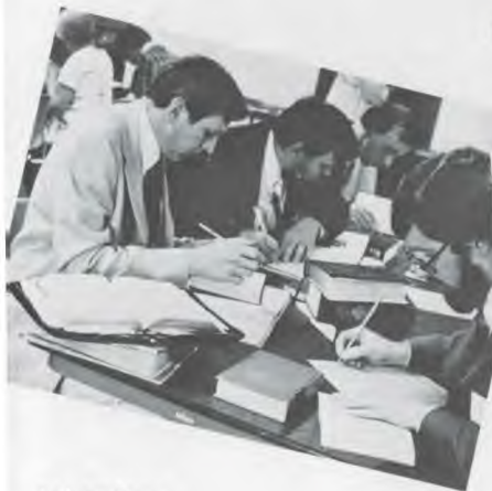
Laboratory groups help sharpen teaching skills.