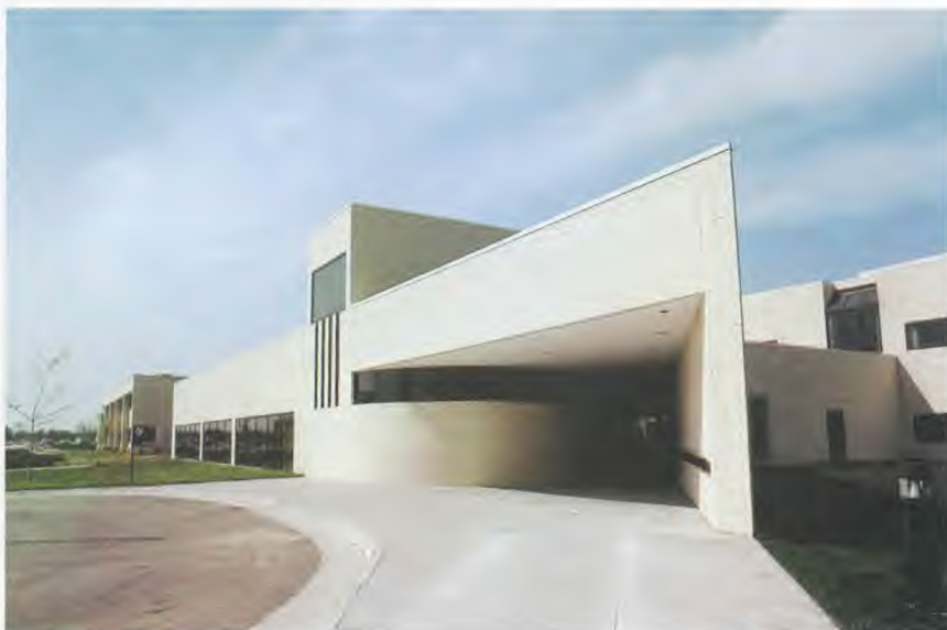
The Moberly (Mo.) Regional Medical Center

Moberly is not an isolated case. Similar success stories are being