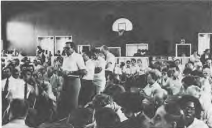
Constituents line up to discuss the sale of the Kansas City Conference Office

Delegates to a special constituency session held August 16 at Sunnydale Academy, voted by a 2-1 margin to accept an offer by a Kansas City firm, Professional Services, Inc., to purchase the former Missouri Conference office building.