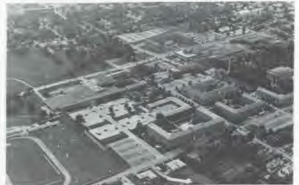
Northeast Missouri State University, site of the 1982 Iowa-Missouri campmeeting, June 1-5.

the conference, many individuals expressed a desire to have one general campmeeting for the entire conference. Acting on these suggestions, the