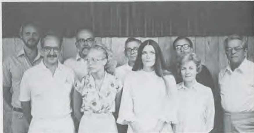
Part of those who stopped smoking during Piedmont Park's latest five day plan.

Wessels contributes this long-range success to the follow-up plan he uses after the five days are over. The Monday night after the last program a "rap session" is called, giving the participants opportunity to compare notes