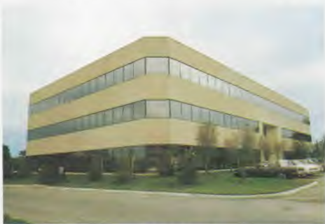
The new AHS/EMA corporate headquarters building is located in Shawnee Mission, Kan., adjacent to Kansas City.

Combined, AHS's four regional hospital corporations comprise