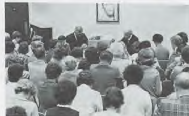
Every Thursday morning, the Voice of Prophecy staff gathers to read prayer requests sent from all parts of North America. God’s answers to the intercessory prayers offered have been a strong witness to those who write.