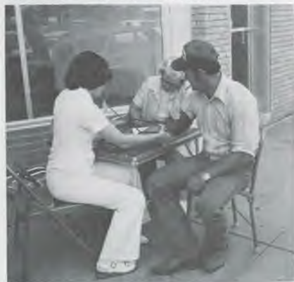
Visitors at the blood pressure clinic at Rockwell City

A blood pressure screening clinic conducted in Rockwell City, Iowa, on August 24 attracted considerable interest from the business community of the city and high praise from the local Civil Defense Director.