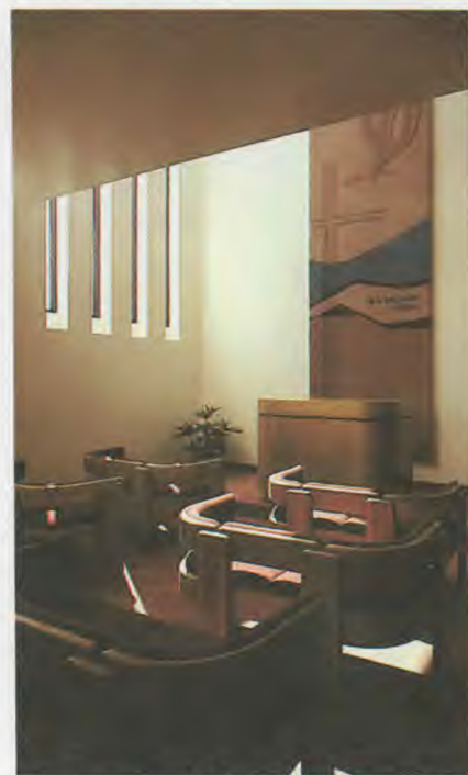
The chapel at Moberly Regional Medical Center, Moberly, Mo., provides a central focus for patients and visitors. The center was completed and dedicated this spring.

Recognizing these needs for strengthening, the Seventh-day Adventist Church has established the Adventist Health System, which is operated in geographical systems for managing its health care facilities.