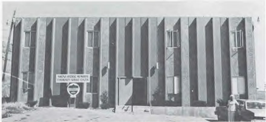
The new center is housed in the upper floor of the gymnasium building on the church grounds.

The new center has been named the "SWENA, WEDDLE MEMORIAL COMMUNITY SERVICE CENTER."