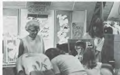
Visitors registering for the free gift at the fair in Atlantic.

The Atlantic Seventh-day Adventist Church operated a temperance booth during the 4H fair August 3-6 at Atlantic, Iowa. A free subscription to LISTEN magazine was given away, and 437 people registered for the free gift. Two