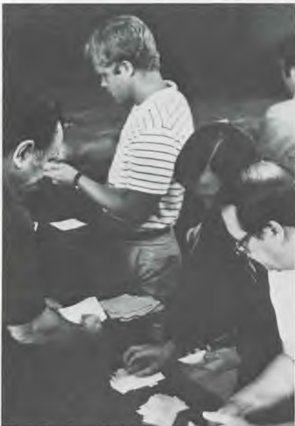
Session delegates participate in the counting of the ballots at the close of the special constituency session.

Following presentations giving background information regarding the recent sale of Sunnydale Academy's SS Plastics industry and the history of the development of the offer to purchase the Kansas City office, discussion on the proposal began and continued for more than three hours.