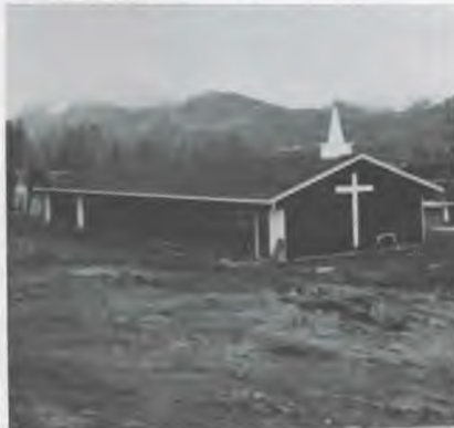
New Palace of Peace Church.

A dream has finally come true. For several years the members of the Palace of Peace Church at Colorado Springs, Colorado, have been working, praying, and sacrificing for their own church building.