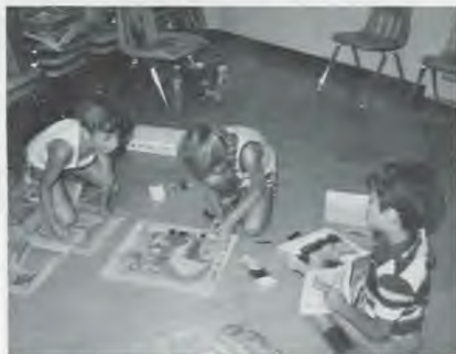
Young boys working on latch hook project at Boulder.