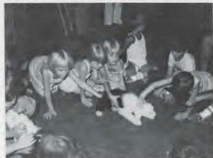
One of the pet store visitors receives a loving welcome at the Boulder, Colorado, VBS.

"We have just completed the biggest and best year that Vacation Bible School has ever had in the Rocky Mountain Conference!!! All of the fig-