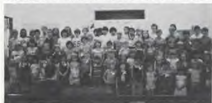
The Arkansas Valley, Colorado Church had a "full crew" of 86 youngsters at VBS.