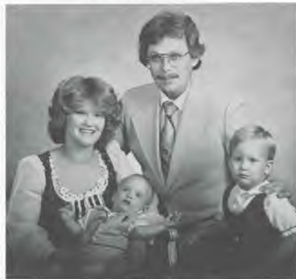
The Siewert Family

He holds a B.S. degree in medical technology from Union college, and is a registered medical technologist with the American Society of Clinical Pathologists (ASCP). He is also a registered radiography (x-ray) technologist.