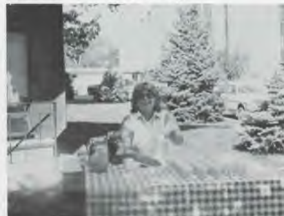
Getting ready for "juice break" outside the Boulder Church.