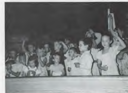
Action songs were a favorite at the Worland, Wyoming, VBS.

Sixty-one of the children came from non-Adventist homes. Twenty-eight of the children earned Bibles under the talent program. The parents that came to the final program commented on how much their children enjoyed the Adventist VBS and expressed amazement as to how much Scripture their children had learned in just one week.