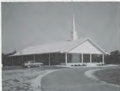
Branch Memorial Church