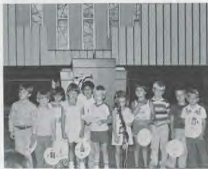
Wichita Kindergarten division children at the closing VBS program.

The first VBS for several years was held in Wichita late this summer. During the VBS the new members, leaders, teachers and children all enjoyed a learning experience together.