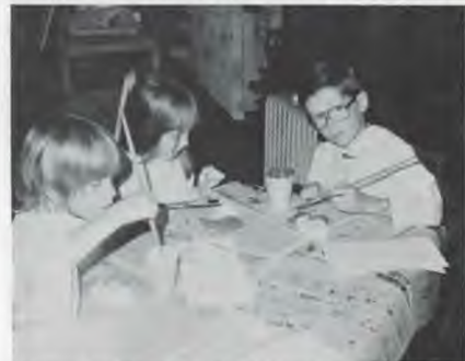
Young artists at work at the Boulder VBS.