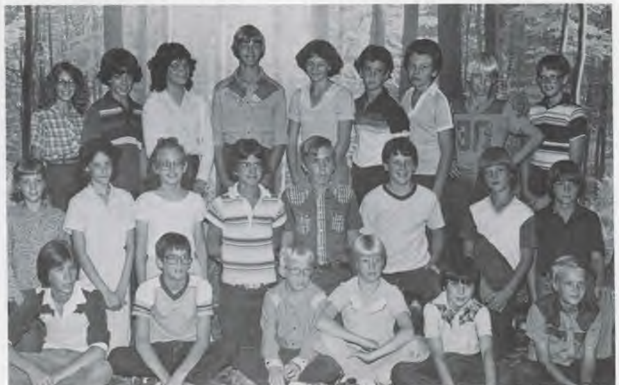
Junior Sabbath School Members

Through the cooperation of many individuals, the juniors had a total of $1,000.00 to send to SAWS, World Vision, and Food For The Hungry. The leaders requested that these agencies use the funds for food, or the transportation thereof, to the hungry of East Africa.