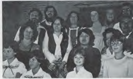
Some of the 24 new members at Loveland.