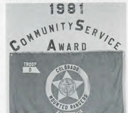
The flag of the "Colorado Mounted Rangers" was tastefully displayed in the Durango, Colorado church on Community Service Award Day.

More than 200 people crowded into the Durango Seventh-day Adventist Church on a recent Sabbath for the annual presentation of the Community Service Award. Each year a service organization in the community is chosen to be honored at a special worship