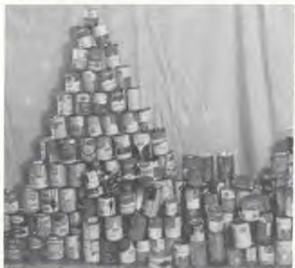
Canned goods collected.