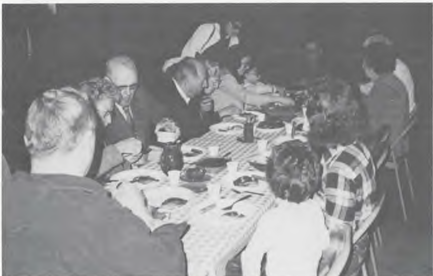
A pancake breakfast was the Pathfinders' way of saying Thank You to the church family for 20 years of unflinching support.