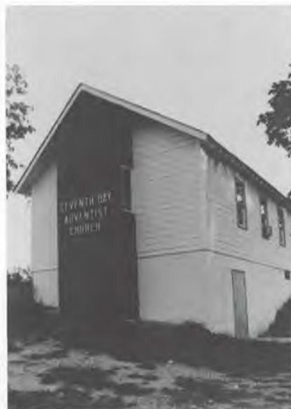
Richville, Missouri Church Building - soon to house a fully organized congregation.

Two "blessed events" are slated for the near future in the Iowa-Missouri Conference. A new company has been formed and a company is about to be organized into full church status.