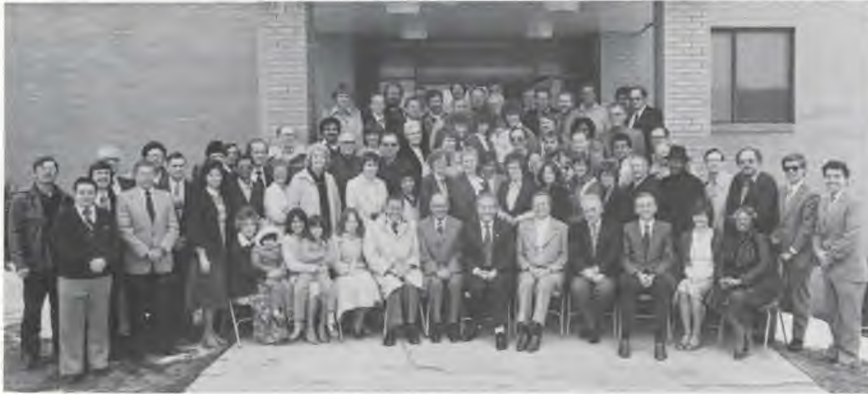
Maranatha II participants set a goal of 120 baptisms, utilizing training received at the week-long Seminar.