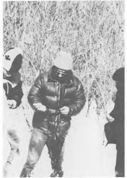
Counselor giving instruction.

The exhausted College View Pathfinders and staff headed for home with the memories of the good times fresh in their mind.