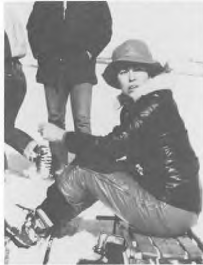
A counselor watching the proceedings.

The time was spent very wisely . . . keeping warm, eating, and sleeping . . . not always in that order. The Pathfinders did learn some valuable lessons in winter survival and fire building. The Saturday night hike was