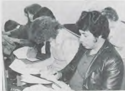
Members from Elm Creek and Holdrege churches using the Bible and worksheets to find their particular Spiritual Gifts.

Thirty-six members of the Elm Creek and Holdrege Churches recently attended a two-weekend spiritual gifts seminar held in the Holdrege Church.