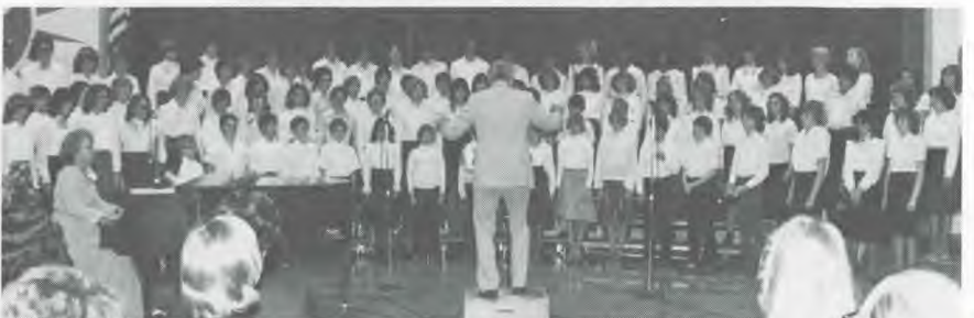
Secular concert at Platte Valley Academy.