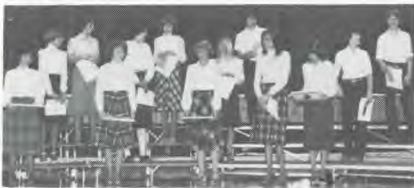
Winners of Kansas poster contest.

All Seventh-day Adventist youth in Kansas and Nebraska may participate if they are in grades five through eight next year.