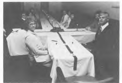
The Communion table.

The past two years the Gladstone, Missouri Church has held a special candlelight communion service for couples on Valentine weekend. The communion tables were set in the form of a cross, a chair was placed at the head of the table for Jesus, the special guest.