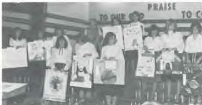
Winners of Nebraska poster contest.

In Kansas, First National Bank of Topeka sponsored four first place awards of $50 savings accounts, Enterprise Academy sponsored four second place scholarship awards of $25, and the Conference Office of Education provided four third place awards of art kits. All students who submitted a poster received an honorable mention ribbon and completed one of their Junior Missionary Volunteer requirements for investiture.