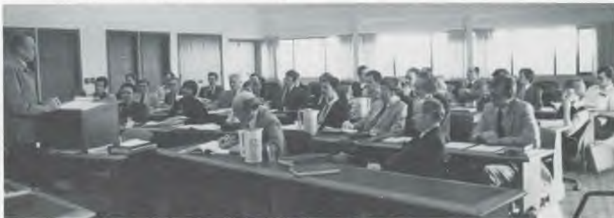
Thirty-five Mid-America pastors attend AU Extension School course.

pastor-students in the program, which is offered twice a year in the union. The next scheduled session will be held in September, and will cover "New Testament Issues: Revelation and Inspiration as Demonstrated in the Gospels".