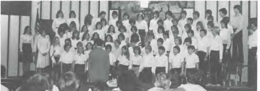
Friday night sacred concert at Enterprise Academy.