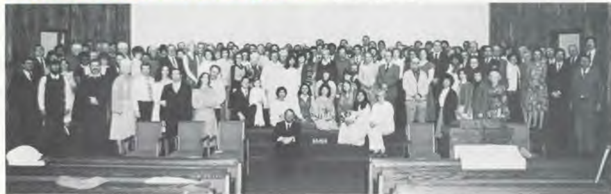
More than 200 attend evangelism training seminar.

The Lay Evangelism Training Weekend at Glacier View Ranch in February will be long remembered by those participating!