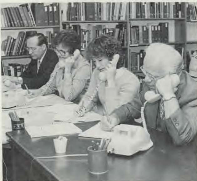
October will be a busy month at the Voice of Prophecy when the Wide Area Telephone Service (WATS) lines will be operating.