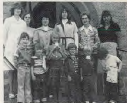
Children and leaders of the LeCenter VBS.