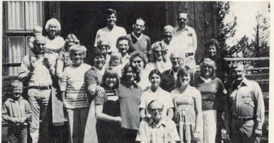
This is a group of active Mid-America MPH students.