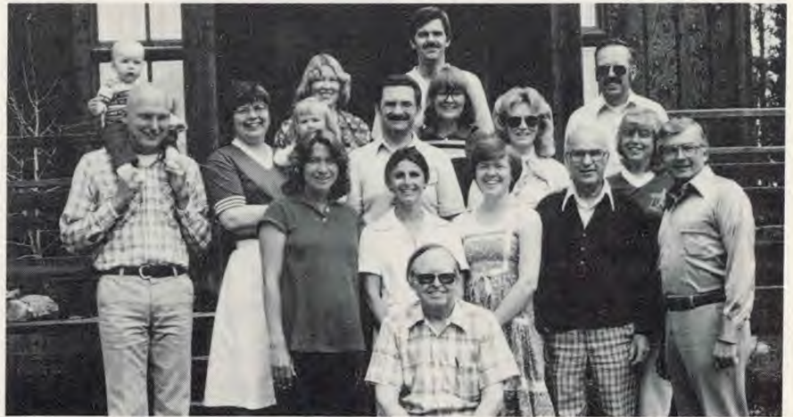
This group attended the LLU course, "Principles of Health Counseling" at Camp Glacier View.