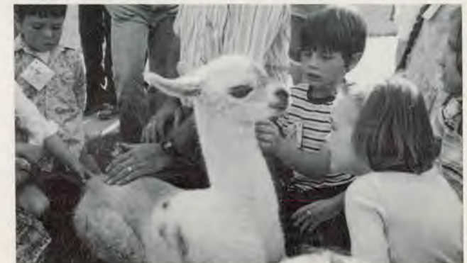
Special visitor to Vacation Bible School at Eden Valley was the llama.