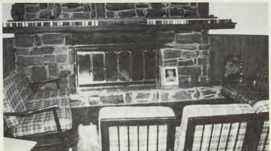
Fireplace surroundings in the lodge.