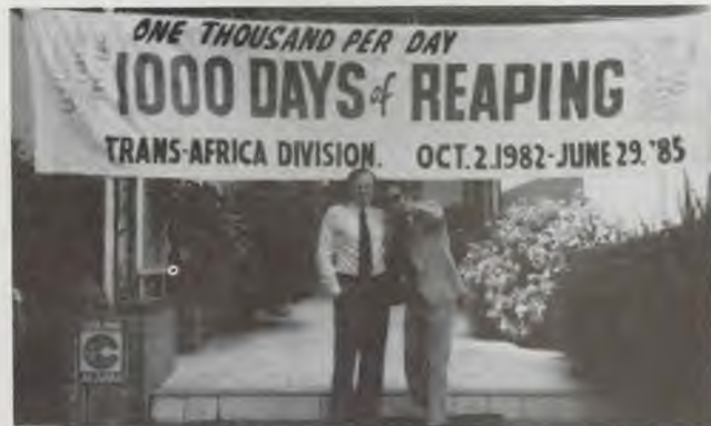
The chapels will enhance our cooperation with the world field in baptizing 1,000 souls per day during the 1,000 Days of Reaping.

Bricks were made by the church members in their spare time and burned in their own kilns. Women helped by carrying water and treading clay. The children stacked the bricks to be sun dried before being burned in the kiln. Masons were called in to build these churches at their own expense. When this year's second quarter offering is received, the same procedures will be followed in building the children's chapels. The offering will supply the roof, the door frames and window frames while the members will do the rest. With their sacrifice in labor and your sacrifice in funds, many children's chapels will be built. Our aim is to build 200 children's chapels.