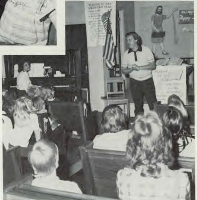
Notice how well this teacher holds attention.

Eight parents of VBS students expressed an interest in learning more about the beliefs and practices of Seventh-day Adventists. Twenty-five Bible studies have been started as the result of contacts made in the homes of VBS students. One branch Sabbath School has been operating as the result of interest begun in Vacation Bible School.