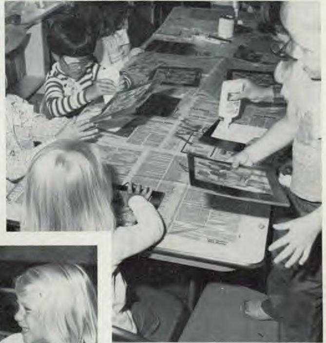
Busy, busy fingers!