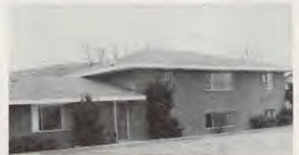
Shown above are faculty/student residences.