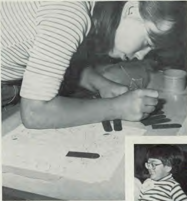
Ever see such concentration!