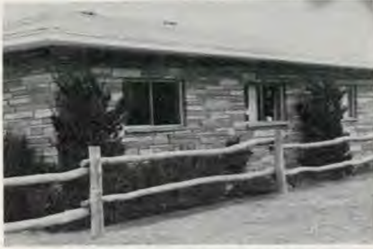
Administrative Office Building