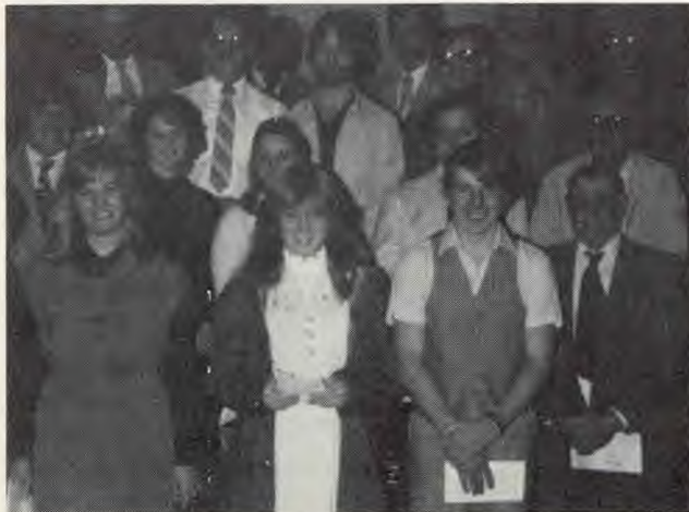
Some of the new members of the Davenport Church.