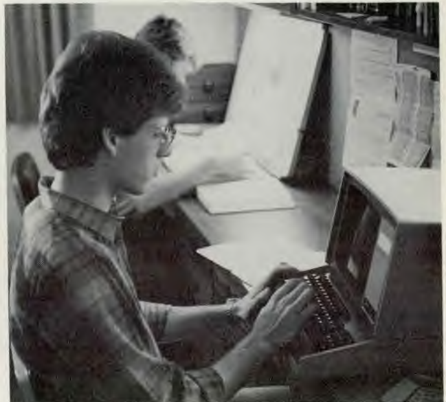
Computer terminals to be installed in dormitory rooms will enable students to have easy access to terminals.

Berg also feels the move will point up inadequacies in Union's tutoring network. He predicts many students will feel "stranded" without a tutor to guide them through initial adjustments and routine homework.