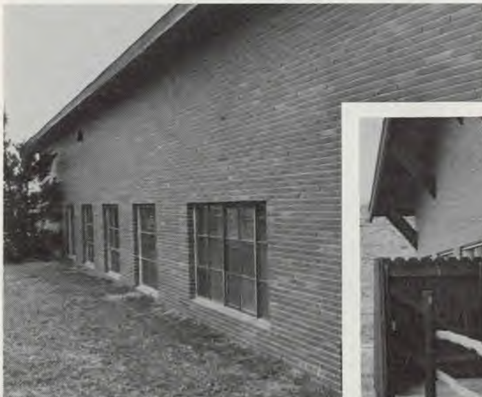
Building that houses the shop