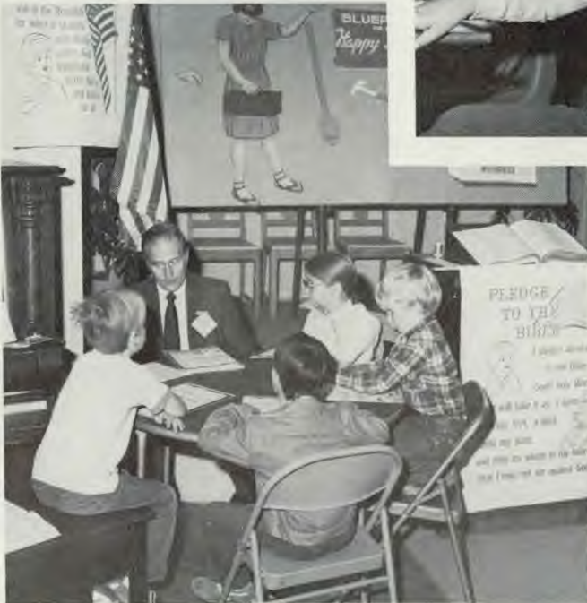
Small classes build student-teacher relationships.