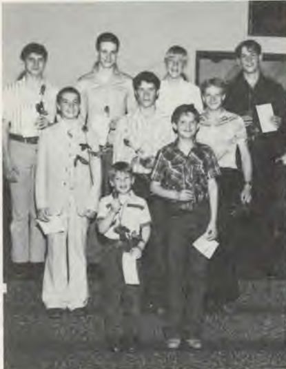
Group of boys who were baptized

The ranch is ready to receive boys aged 12 to 18. For initial information write or call Don Lair, Box 702, North Platte, NE 69101.