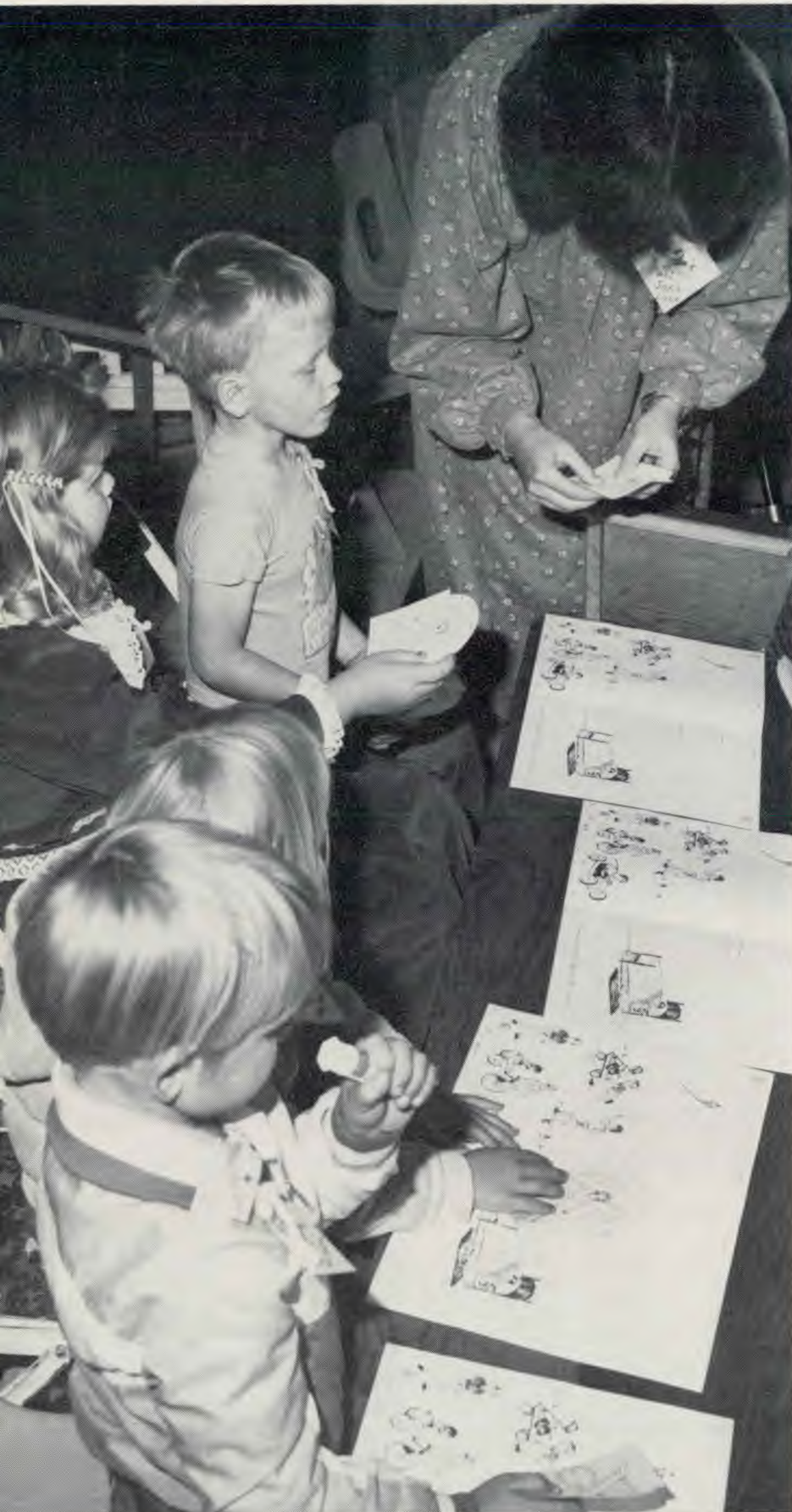
Little folks work hard in their workbooks.

Here is a fact that may startle you! Forty-five of the non-member students at our VBS programs were enrolled in Seventh-day Adventist church schools during the 1982-1983 church school term!!!