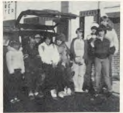
Laramie, Wyoming church school students arrive for their weekly visit to "adopted grandparents."