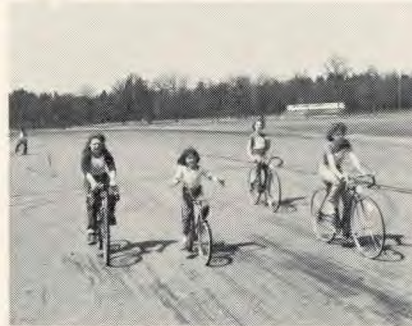
The facilities, safety, and beauty of the raceway made it an ideal place for the Bike-A-Thon.

On Sunday, April 24, 1983, the Minnesota Pathfinder Clubs of the Seventh-day Adventist Churches met at the Brainerd International Raceway to participate in a Bike-A-Thon. It was a gorgeous spring day, and enthusiasm ran high among the bikers.