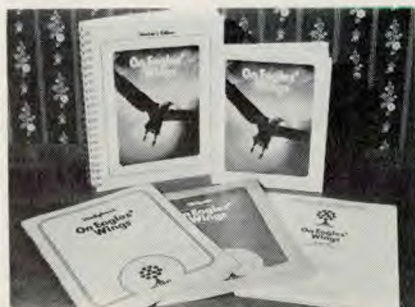
Materials from the new Life Series.

Much emphasis is placed on study skills in the Life Series. Research has taught educators that if they can teach children how to study, how to reason from cause to effect, how to infer, and how to interpret, the children will be better prepared to meet the demands the world will place on them. The new textbook series offers a comprehensive program that provides diagnostics, instruction, testing, and enrichment—a first in the Adventist educational system. The emphasis on preparation for this life and for the life to come is why the series has been entitled The Life Series.