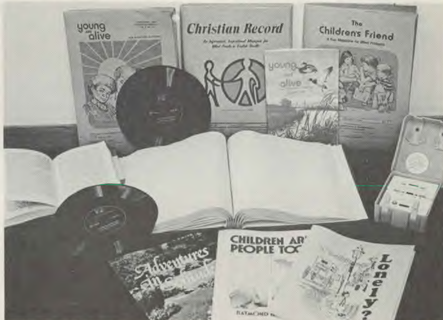
A sampling of reading services sent to blind persons for the purpose of spreading God's Word.