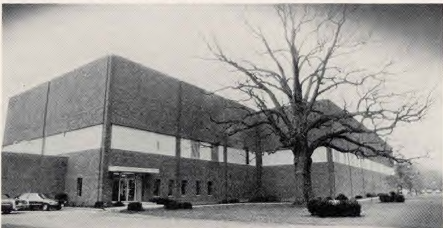
Home of Worthington Foods, Worthington, Ohio