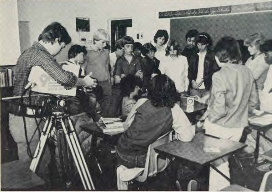
KBTV-Channel 9 visits Mile High Academy

A television news team from KBTV, Channel 9, in Denver, came to the seventh-grade classroom at Mile High Academy to film a presentation on hearing conversation. The presentation was then telecast on Channel 9's "Sundown Program" on Monday, May 2.