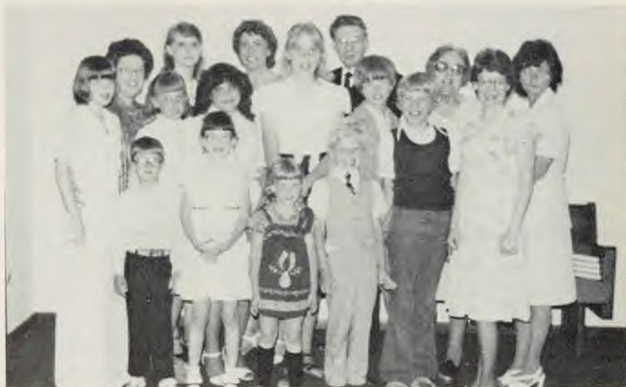
COLUMBUS, NEBRASKA —The Columbus Church held their second Vacation Bible School in June, with 21 children attending. Pictured are some of the children with the teachers and leaders.