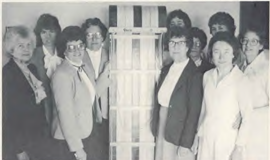
Members of the Ladies' Action Team with the tobaggon they provided for the academy.

The ladies of the Grand Forks, North Dakota church have organized to form a Ladies' Action Team. They meet periodically in private homes, sharing with each other and the Lord, their concerns for the spiritual strengthening of their families, the church and the community.