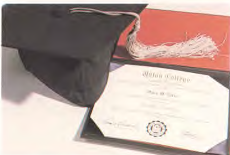
Design and Photography by Fred Knopper

Note: Because Union College can provide VIP treatment for only a limited number of guests at one time, reservations have to be made on a first-come, first-served basis. So call today.