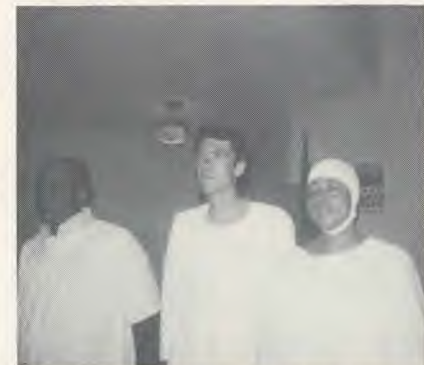
Candidates prepared for baptism.

On Sunday, August 7, there was a picnic held at Union Park. This was a time of fellowship and recreation for the members and friends of the Philadelphia Church.