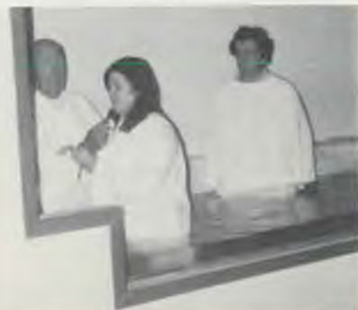
Two baptized at Pagosa Springs