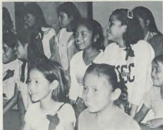
Happy faces reveal interest of Navajo children at La Vida Mission Vacation Bible School.