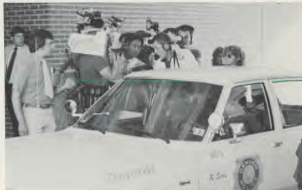
Thomas Starzl, M.D., answers reporters' questions upon departing Porter Hospital with a liver to be flown to Pittsburg for transplantation.

Both Porter patients had been placed on life-support equipment in the pediatrics intensive care unit but were determined by physicians to be brain-dead.