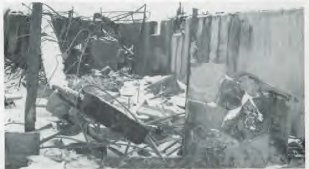
All that remains—ashes, twisted pipes and concrete walls—of the Watford City church.