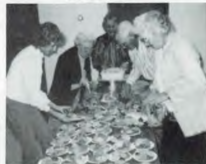
The Hepler, Kansas church Community Services Society prepared fruit plates, which included home-made cookies, to give to the elderly and shut-ins in six surrounding communities.