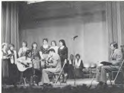
Eden Valley, Colorado church members presented a multi-lingual musical program as a community service at Christmas time.

Chosen passages from The Desire of Ages provided narration for the program and a copy of The Desire of Ages was offered as a gift to anyone wishing to receive it.