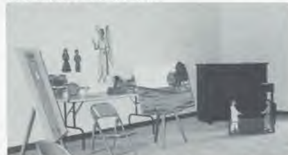
Kindergarten room in the new church.