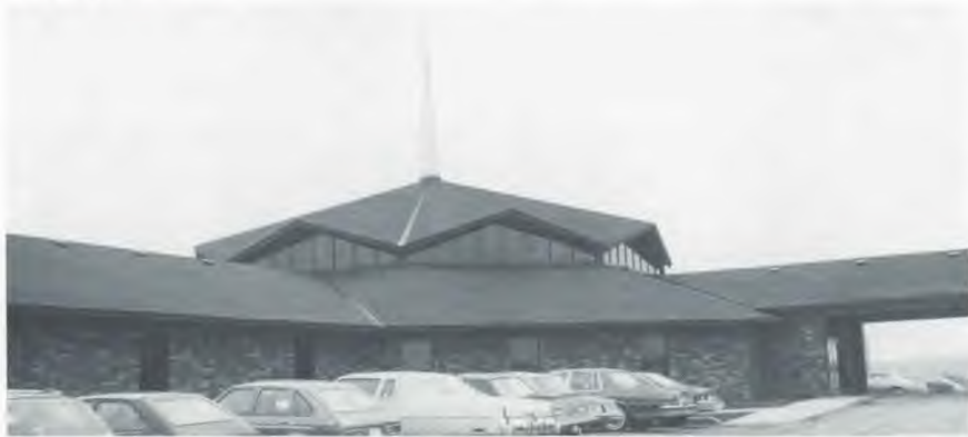
New church in Rochester

The pastor's words, "Welcome Home," were a sweet sound to those at the Rochester church on July 14. Their previous church had been sold and for a year they had been renting the Baptist church while their new one was under construction. It was sweet indeed to be in a new church and to be in one that provided enough space for each division to have its own Sabbath School room!