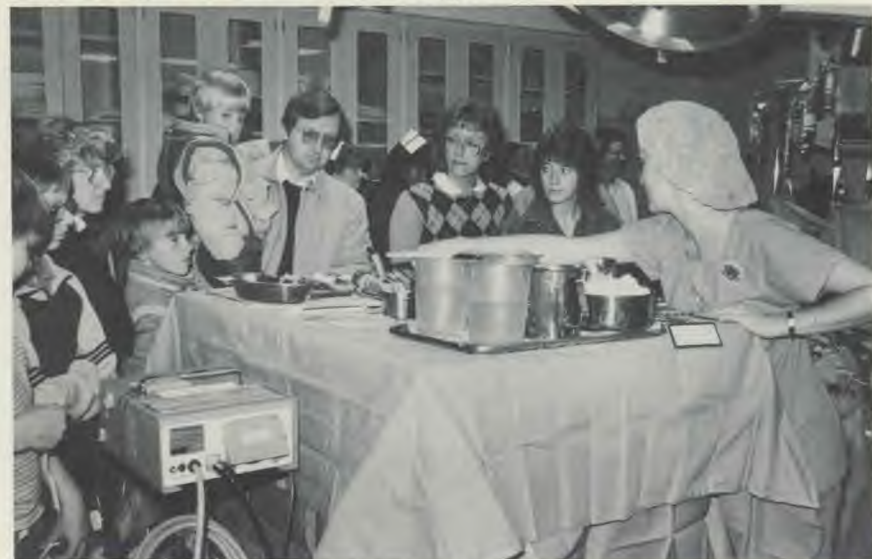
Visitors show keen interest as an operating room nurse points out and explains instruments used in heart surgery. The open house was in honor of National Operating Room Nurses' Day.

More than 500 people toured two cardiac surgical suites and viewed a simulated heart operation at the hospital's operating room open house on November 11.