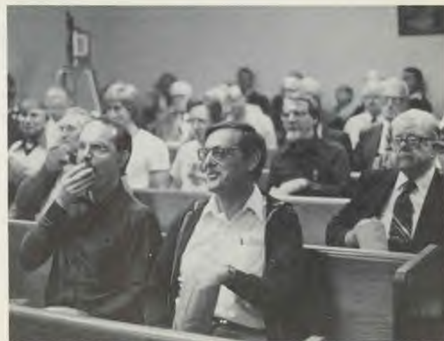
Sabbath evening was a mixture of popcorn, punch and information.