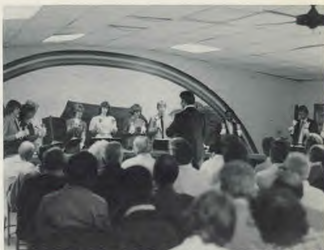
Sunnydale Academy Bell Choir used music to add to the inspiration of Camp Heritage.

The overwhelming feeling of the group in attendance was that we must yearly repeat this type of seminar. If you are an elder or deacon, plan now to be a part of the seminar next fall.