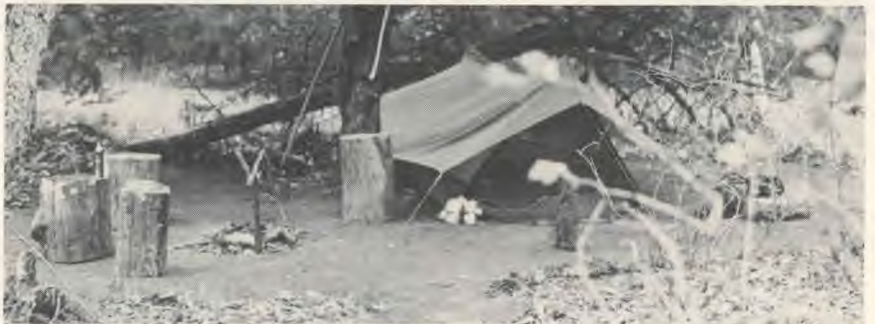
Life around the camp fire, and "housing" enjoyed at the recent Omaha-Mayfield School environmental camp. It was living in and off the wilderness!