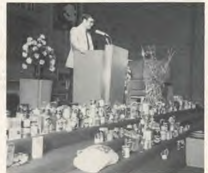
Food donated for holiday baskets.