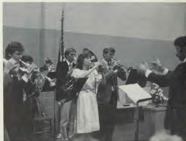
Brass ensemble from Sunnydale Academy brings music to the group at Nevada, Iowa.