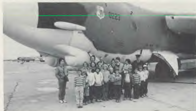
Students from the Thief River Falls elementary school stand beside a B-52 bomber at Grand Forks Air Force base.