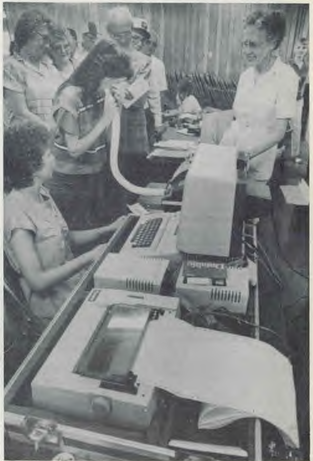
One of nearly 400 people who participated in the Pulmonary Function Test at the Health Fair, blew long and hard into a computerized machine which measured several lung functions. This booth was one of the busiest at the fair.