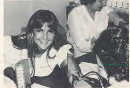
A young lady has her blood pressure checked during PVMC's Health Awareness Day.

Approximately 500 had their height, weight, blood pressure and vision checked and a personal history taken. Professional counseling on how to live longer and healthier was also a part of the day's programming. Screenings also available were: blood chemistry analysis, oral exams, podiatry checks, hearing tests, respiratory evaluation, and coronary risk profiles.