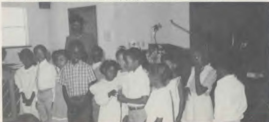
Vacation Bible School closing program Sabbath morning, Palace of Peace, Colorado Springs.

Sister Rowe plans an active follow-up program in the next few months.