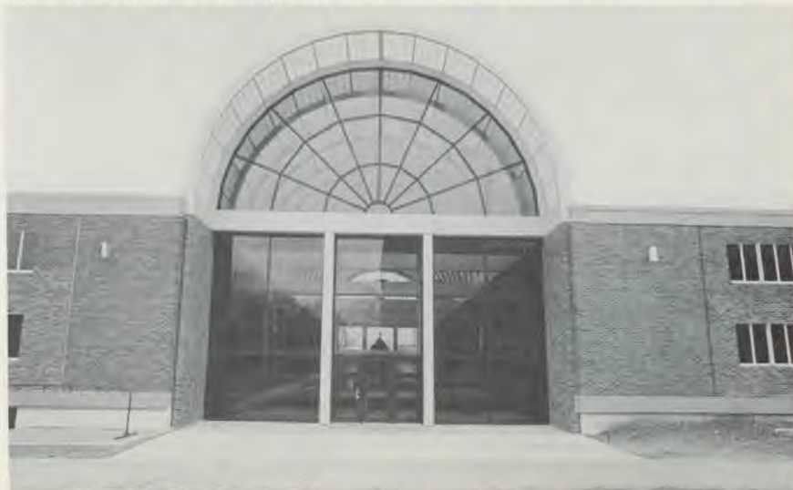
The Ella Johnson Crandall Memorial Library is housed in the remodeled furniture factory.