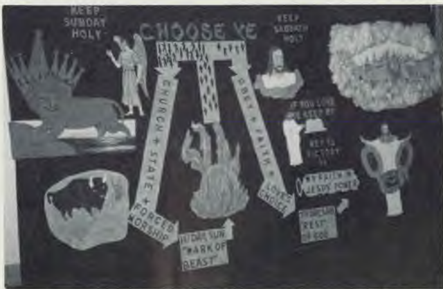
Felts used to illustrate lessons on Mark of the Beast.