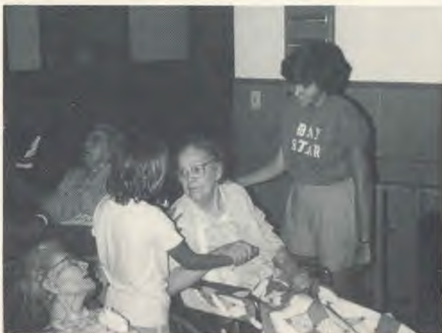
Campers visited nursing home residents.

Have you ever wanted someone to pull up weeds, wash cars, or pick up trash in your community for free? Spencer, Iowa was blessed to have a group of young people from Weimar Institute that organized the youth in the community to do just that.