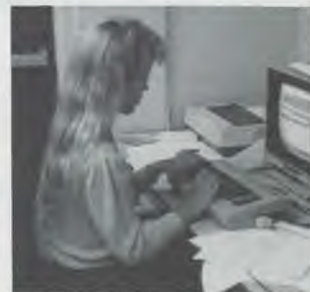
Our schools provide Quality Christian education using modern technology, equipment and instruction.

schools taught by 50 teachers. Sunnydale Academy opened with some 140 students bringing the total to 716 students in the Iowa-Missouri school system. In addition there are many students from the Conference in attendance at Andrews University, Loma Linda University and other Adventist schools. There is a great concern for the many young people who are not privileged to attend our Seventh-day Adventist schools. It is a goal of the Conference to make Christian education available to as many of the youth as possible.