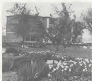
Newly remodeled Administration Building.