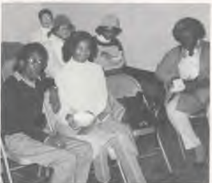
The enrollees of the first Five-day Plan for the Beacon Light church.