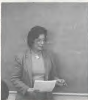
Modern classrooms—dedicated Christian teachers.

Education of the head and heart is supplemented by education of the hand as well as through industrial and vocational classes and through the varied work opportunities in the buildings and offices, in the industries, and on the farm, on the grounds, and in the community.