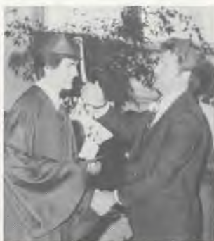
We reach a milestone-graduation.

On the drawing board now is a new sidewalk system, and mall area, as well as numerous other improvements.