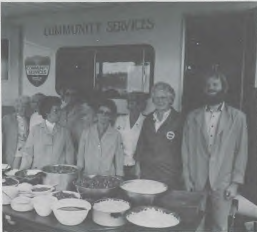
The Denver Community Services staff participated in a mass feeding demonstration at the Eastern Slope camp meeting, feeding 660 people in 40 minutes.

neighborhoods, and minority neighborhoods. We have found this an excellent way to reach people who don't know about the love of God.