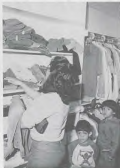
Clothing distribution is just one of many services provided at the center. Others include a health and family education program and disaster assistance.

Native Americans; and half English/half French, Portugese, or other expressions are becoming part of my life. Recently I completed an interview with a Spanish