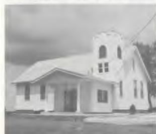
Remodeled in 1978