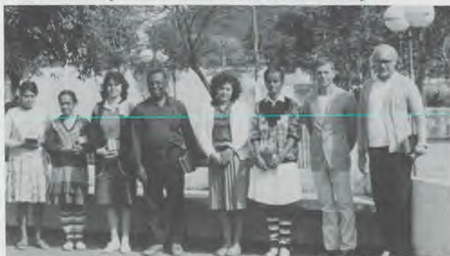
Five of these Brazilian Bible workers are sponsored by the students at Union College. Since January they have baptized more than 80 people into God's family.

Please continue to support our students and our college as we direct and challenge them to become involved in the mission of our church. They are worth it and I thank you for sharing your young people with us at Union College. Pray for them and for us that our college can do what God has in mind and that we can train students not only for a vocation but also for eternity.