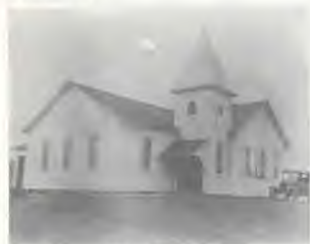
Built in 1890