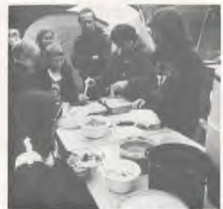
Lots of good food!