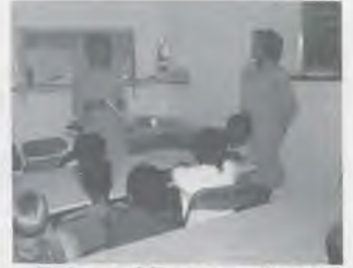
Palace of Peace conducting a craft session for their VBS students.

We averaged about forty-five children per day. A lovely time was experienced by all, even though the weather was sometimes inclement. We had more