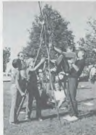
Knoxville club working on the lashing activity.

Thank you, Iowa, for a fine park and for a fine weekend!