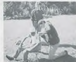
Des Moines club in the bandage relay.

Sunday, the sun was out and warmed the Pathfinders for the morning activities. Each camper had a chance to participate in pitching a tent, tying a knot, lashing, or bandaging an injury.