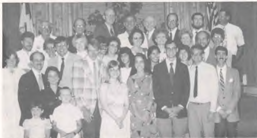
33 persons, all members of the Adventist Church, attended the Clark family reunion.