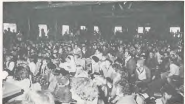
A sea of bodies in the Long House during rain storms.