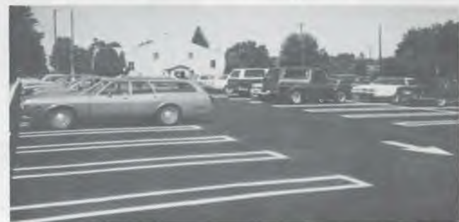
The Greeley church has added a much-needed parking lot.