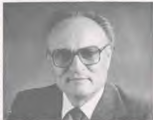
Wilbur K. Chapman