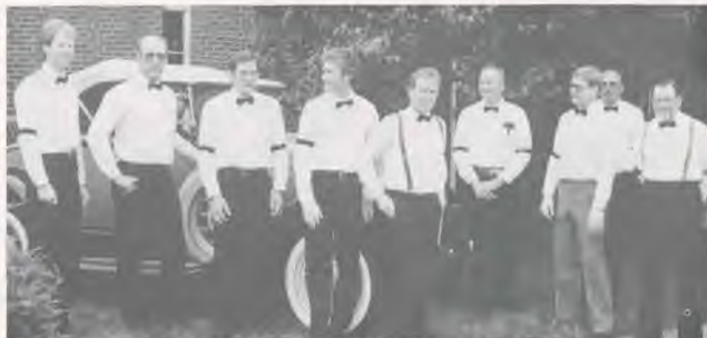
Near an antique car, deacons wore attire from yesteryear.