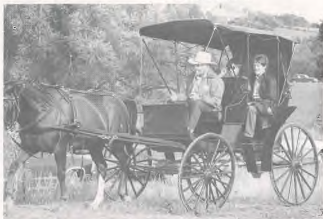
Fred Murray provided buggy rides during the Sunday closing activities.

horse and buggy rides and an old-fashioned chuckwagon breakfast.