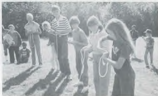
Rolla, Missouri club tying speed knots

The Pathfinders from Iowa and Missouri converged at Lake Keomah, near Oskaloosa, Iowa for the annual camporee. The state park was a beautiful setting for 196 pathfinders and staff. There were six clubs from Missouri and six clubs from Iowa. Rolla and Joplin, Missouri clubs traveled the farthest. The Sioux City, Iowa club was happy to travel only five hours to attend the camporee.