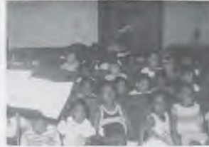
Some of the graduates of the Palace of Peace VBS.

Palace of Peace conducted a Vacation Bible School during the week of August 4-9. We needed transportation and that problem was solved when one of our sisters loaned us her van, along with sending her children to the meetings.