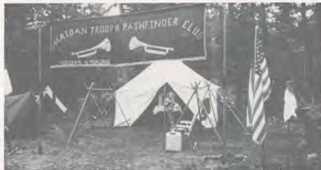
There were all kinds of campsites--plain and fancy!