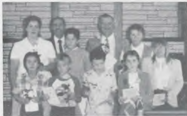
Newly baptized members.

It was 11:00 a.m. on Sabbath morning, September 20, and something exciting was about to happen. The St. Cloud church prepared to welcome nine members into their fellowship. The baptismal pool was full and the candidates ready, but the story doesn't really begin there. It began months, and in some cases, years before.