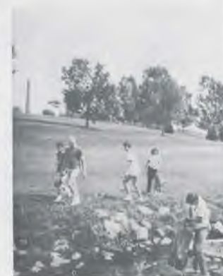
ACT class members clean up Harvard Park.

Other activities planned for the ACT class include: temperance programs for public elementary schools; peer counseling for substance abuse; sports clinics; "Rag Doll," a play on child abuse; "Addict," a play on drug abuse; elementary school tutoring; Christmas party for underprivileged children; adopt-a-grandparent for senior citizens.