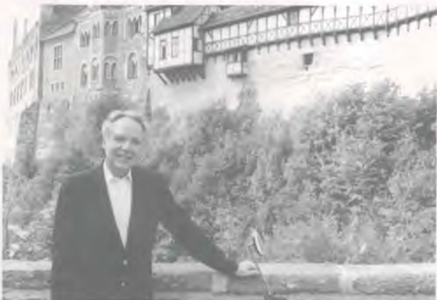
George Vandeman taping on location at Wartburg Castle in East Germany for "What I Like About the Lutherans!"

Note: Available by *satellite and cable nationwide through: Atlanta-WTBS-17 at 7:00 a.m., Eastern time; New York—WOR-TV, Ch. 9, 11:30 p.m. Eastern time.