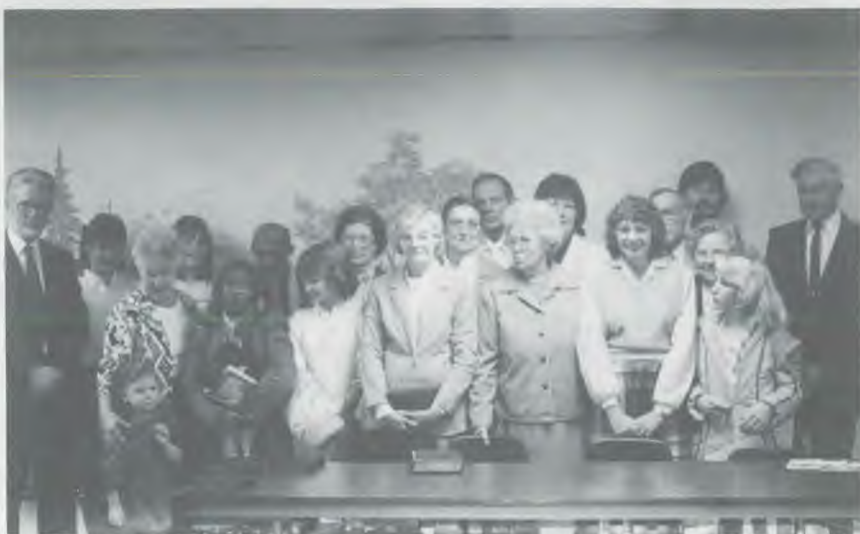
Above: Charter members of the new Troy Church gather on a recent Sabbath. Below: Signing the certificate of organization.