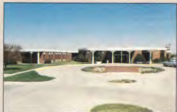
Northwest Kansas Regional Medical Center Goodland, KS