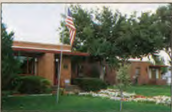
Sedgwick County Hospital Julesburg, CO