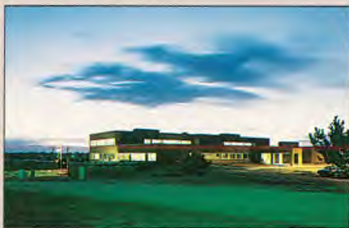
Platte Valley Medical Center Brighton, CO