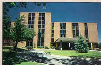
Boulder Memorial Hospital Boulder, CO