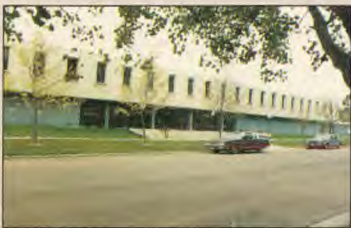
Pipestone County Medical Center Pipestone, MN