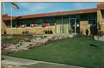
Karlstad Memorial Hospital Karlstad, MN