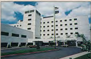
Shawnee Mission Medical Center Shawnee Mission, KS