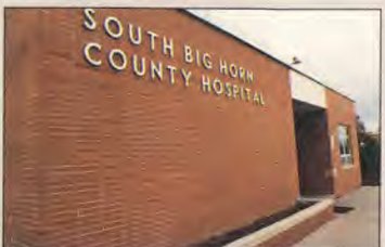
South Big Horn County Hospital Greybull, WY