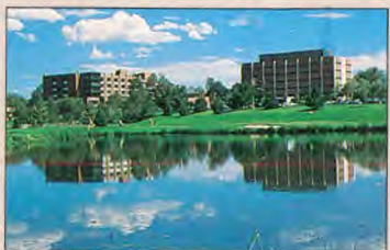
Porter Memorial Hospital Denver, CO