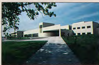
Moberly Regional Medical Center Moberly, MO