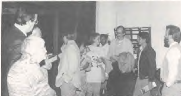
Gathering for Ingathering