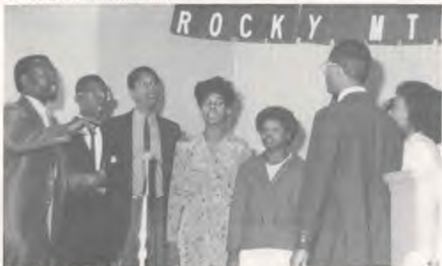
The singing group, "Just a Portion".