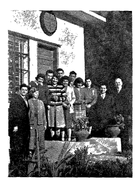
Production Staff Voice of Prophecy Beirut

Here in the Middle East some study had been given in former years to the possibility of the radio work, but no concrete plans were made until the Autumn Council in 1950. At that time the General Conference representatives present gave assurance that funds could be provided to build and equip a small radio studio to be located at the Middle East College. Here the talents of students would be available for the