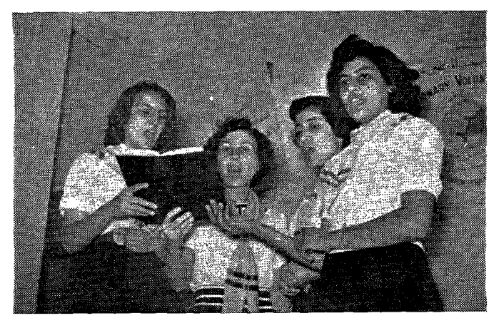
Ladies Quartette Youth Rally Middle East College