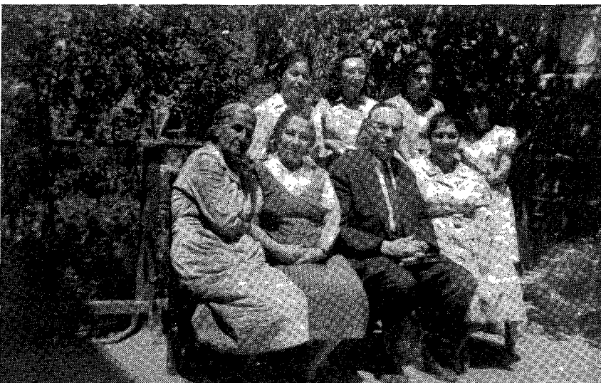
Vacation Bible School instructors at Tabriz, Iran