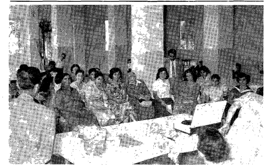
A view of some of those who were attending a Dorcas Federation at Middle East College in Lebanon.