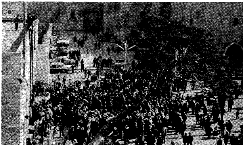
Bethlehem square on Christmas day. The tree overlooking the square was decorated again this year by the church in Jordan.