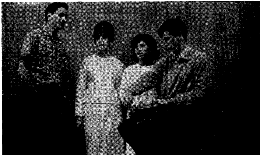
A mixed quartet is seen singing at a Saturday evening variety program at Middle East College, November 6. Special guests for the occasion were 18 students from the Lebanese Institute for the Blind, Baabda.