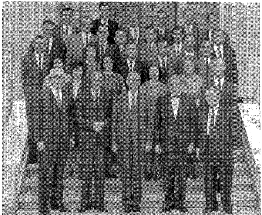
Members of the division committee pictured with other workers during the annual meeting, November 3 to 8.