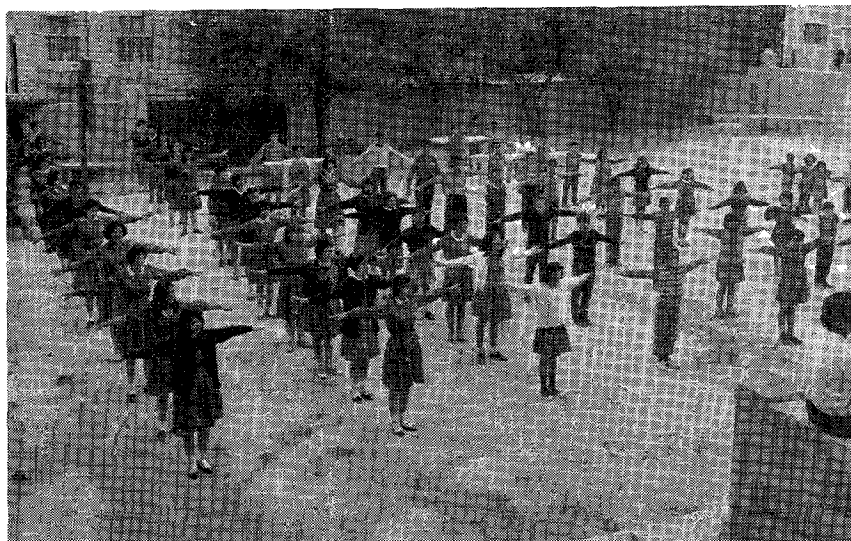
Students at the Amman school taking exercises to begin the school day.